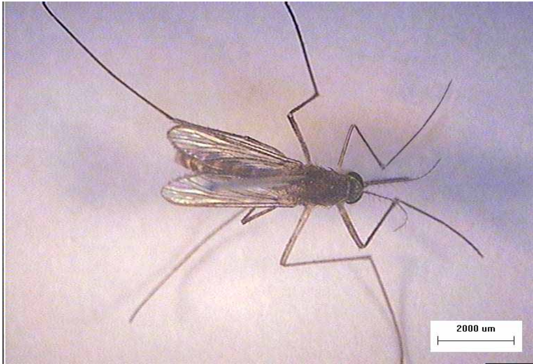
Plate 2.2: Culex quinquefasciatus , one of the urban pests in Malaysia.