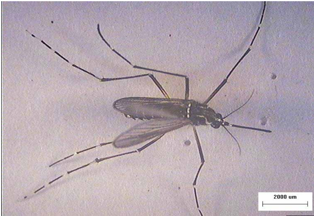
Plate 2.1: Aedes aegypti , the important vector of the yellow fever and dengue.