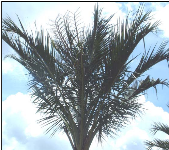
Figure 2.5 Angau Muda – flowering palm