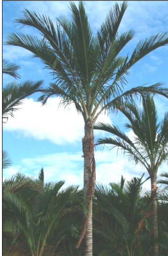
Figure 2.2 Plawei – palm that has reached maximum vegetative growth