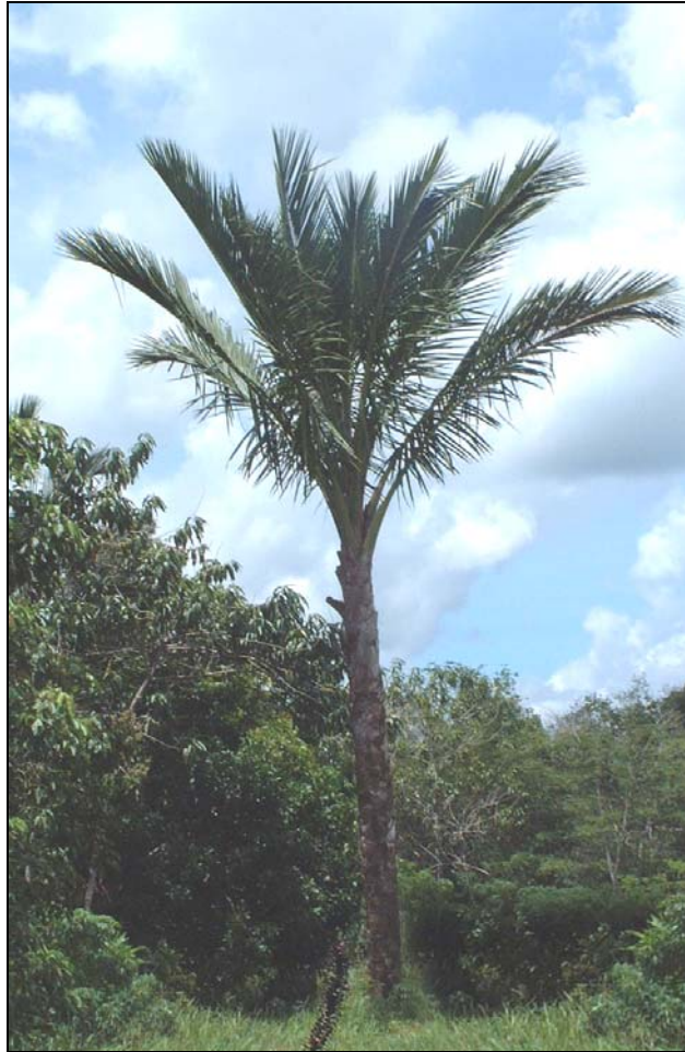
Figure 2.3 Plawei Manit – inflorescence emerging palm