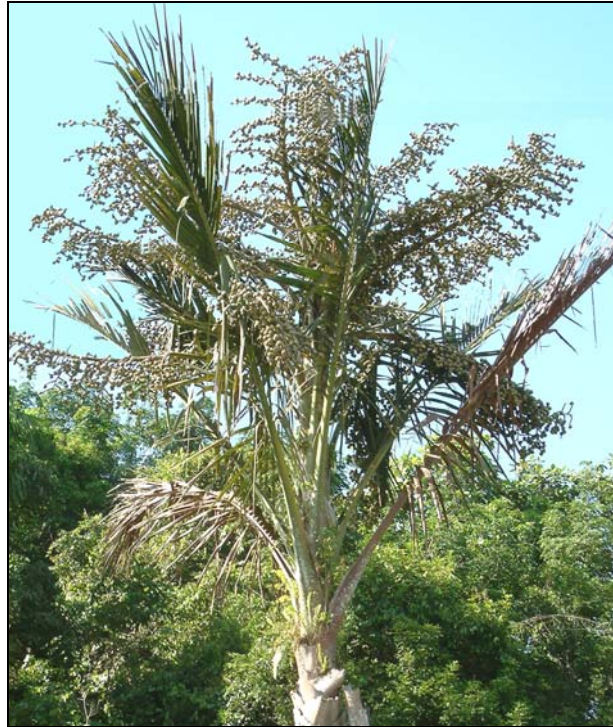
Figure 2.6 Angau Tua – fruiting palm