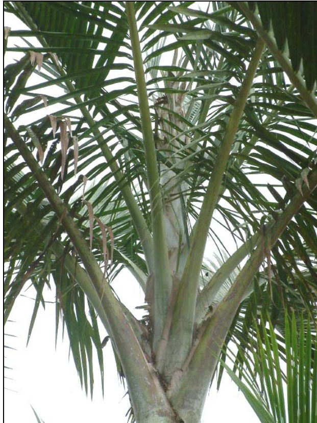
Figure 2.4 Bubul – inflorescence developing palm