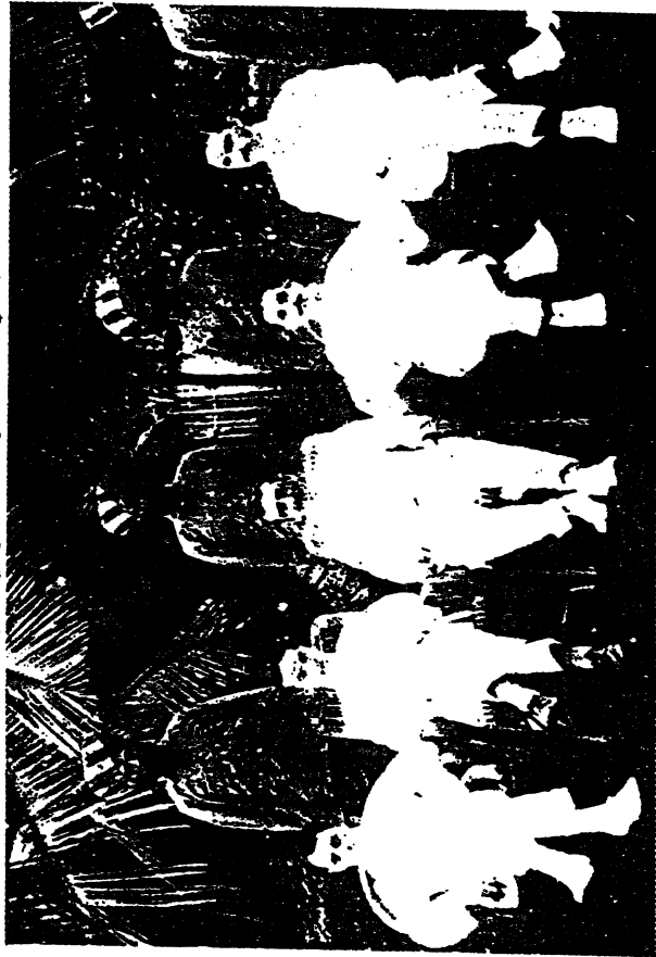
1a European planters