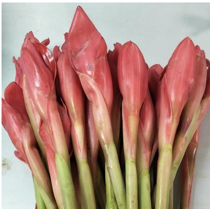
Figure 2.1: The flower of E. elatior

In Malaysia, E. elatior , also well known as Bunga kantan, is traditionally used by local folks for food flavouring and medicinal purposes. Young shoots and buds of E. elatior are consumed raw as fresh vegetables or ulam (Ghasemzadeh et al., 2015). Besides that, its flower (Figure 2.1) is commonly used as condiment for many iconic Malaysian dishes, for example asam laksa, nyonya laksa, asam pedas, nasi kerabu, and nasi ulam.