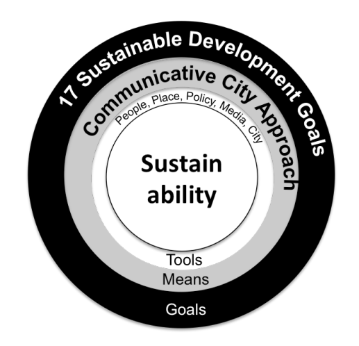
Figure 01. Communicative City Approach Diagram

Communicative Approach may serve as a mediator of the plan to achieve the goals. Media usage also may serve as a tool to achieve the goals of localizing the SDGs. There is research on the setting of an agenda that shows an explanation of how the media shapes the perception of the public by emphasizing what is important by giving limelight on some problems and throwing others. People on the political background has been long learned that they could manipulate the media to put aside a major problem by making the public rank the problem lower than the agenda they propose (Tan & Weaver, 2009). This approach can be used to emphasize the importance of SDGs by reversing the action to pace the development of the SDGs, Figure 01 may conceptualize the said concerns. Other tools of communication also may be used to convey the objectives of the SDGs in the context of localizing the Sustainability. This further emphasized by expressing hope or wishes of the communication technologies that may help people define and shape urban and public spaces, creating a place for communication to occur.