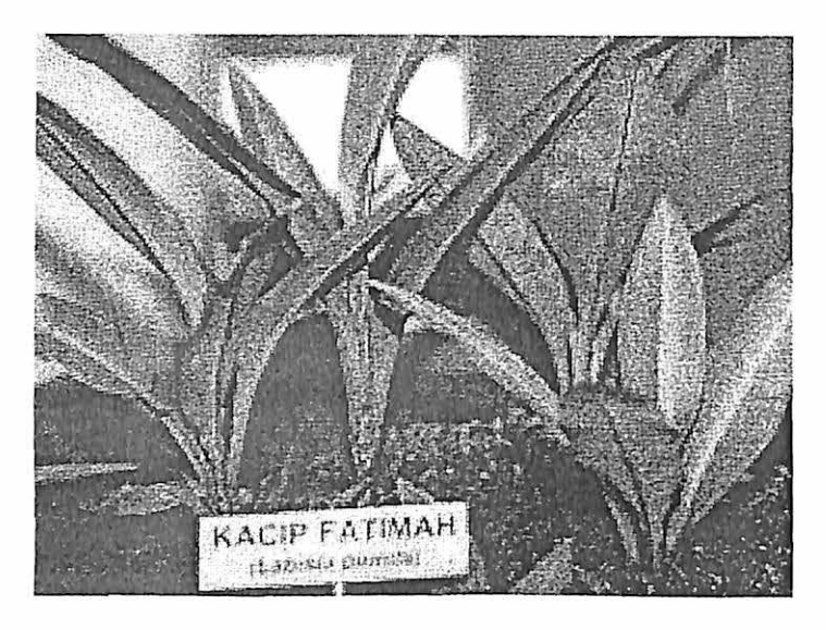
Figure 1. Kacip Fatimah Plant These are leafy plants with leaves ranging from 4-14 arranged in an upright position.