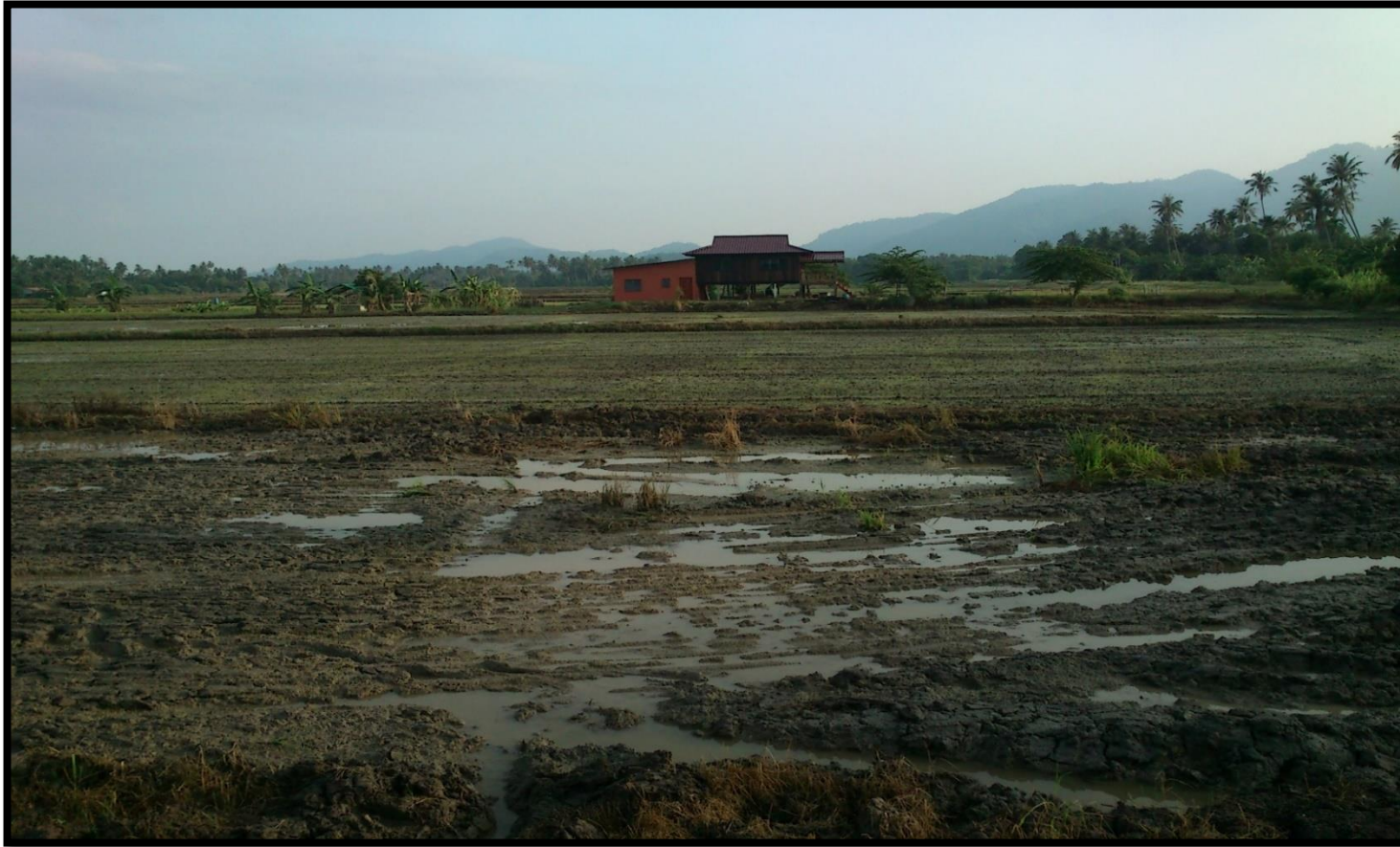
Plate 3.4 : Sungai Burung Darat rice field plot which is located behind the Department of Agriculture (DOA) Barat Daya, Balik Pulau