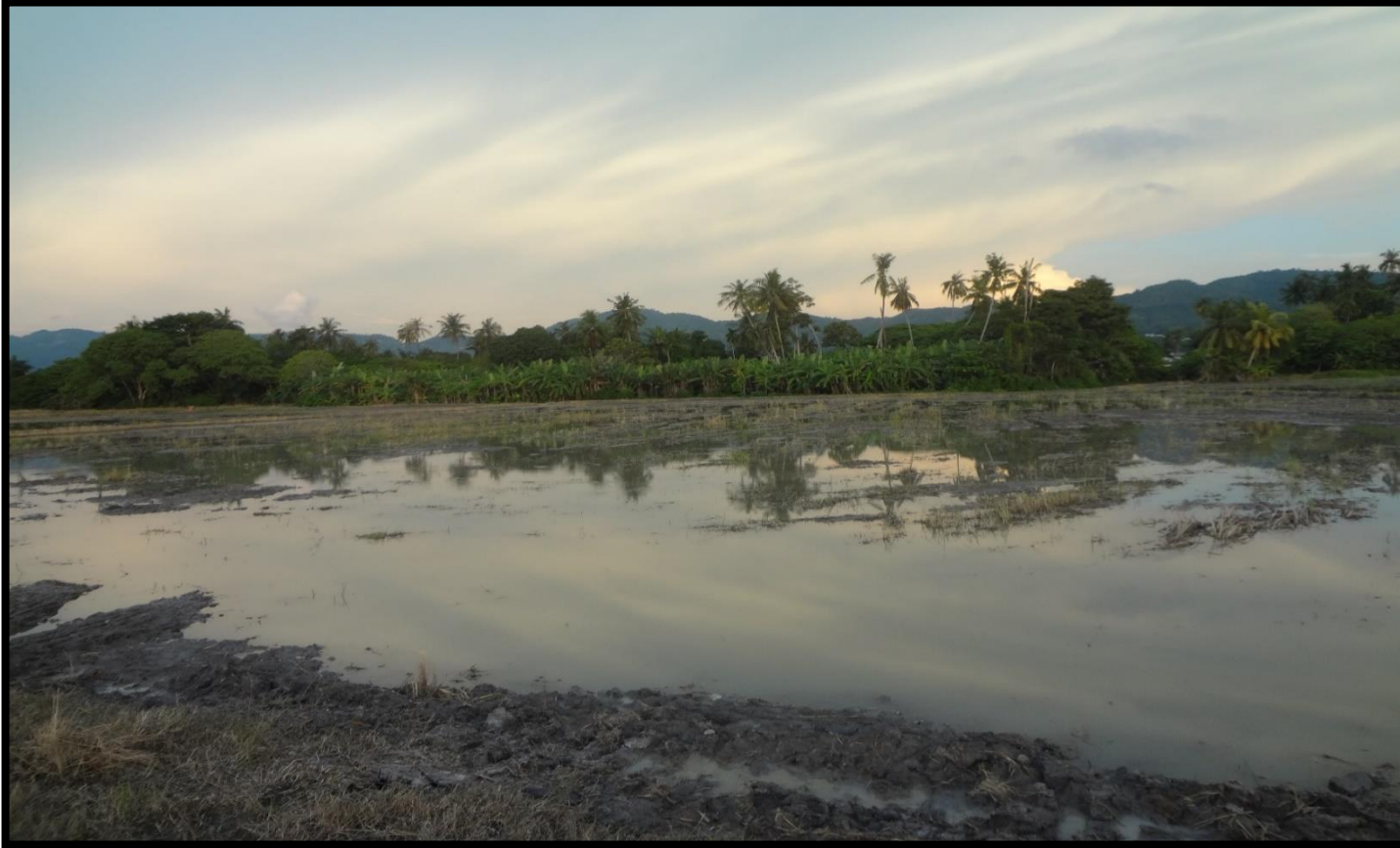
Plate 3.3 : PPK Fasa 1 rice field plot