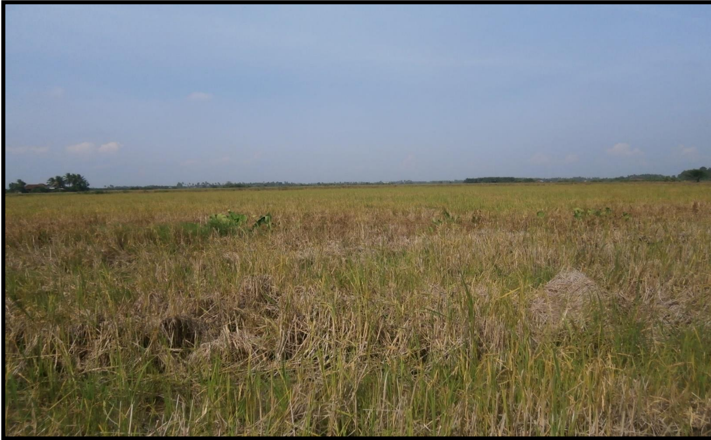
Plate 3.2 : PPK Fasa 3 rice field plot