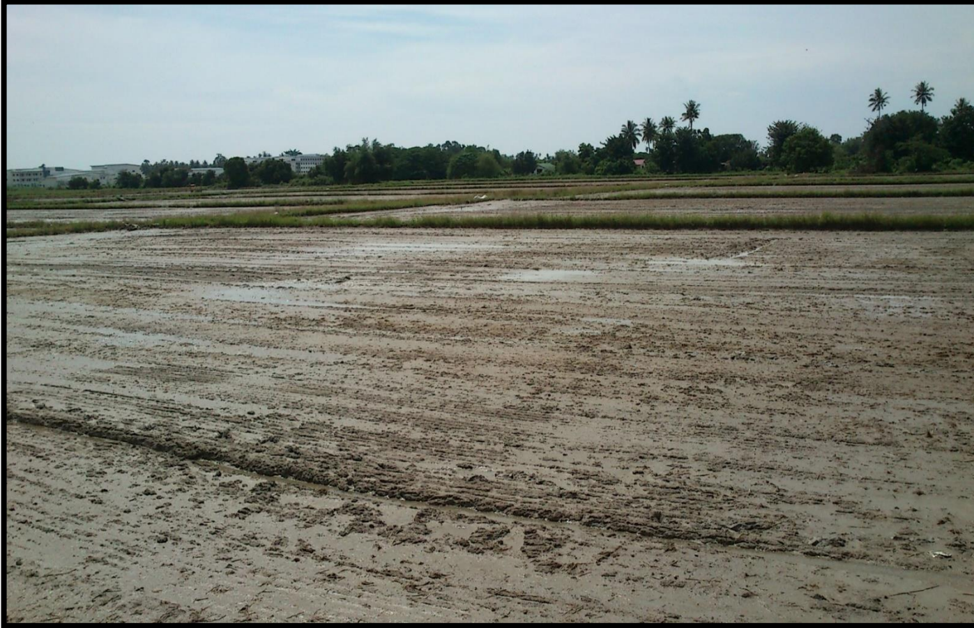
Plate 3.1 : Pokok Kenanga rice field plot which is located near to the Politeknik Balik Pulau