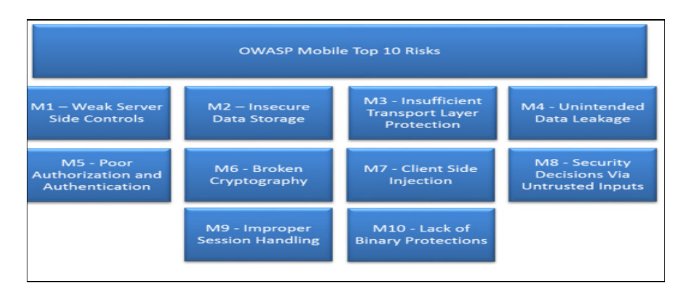
Figure 2: OWASP Top 10 mobile security risks [6]

Owasp has listed the top 10 mobile security risks as shown in the figure 2. Each of the consequences of the respective risk will be discussed in following section.