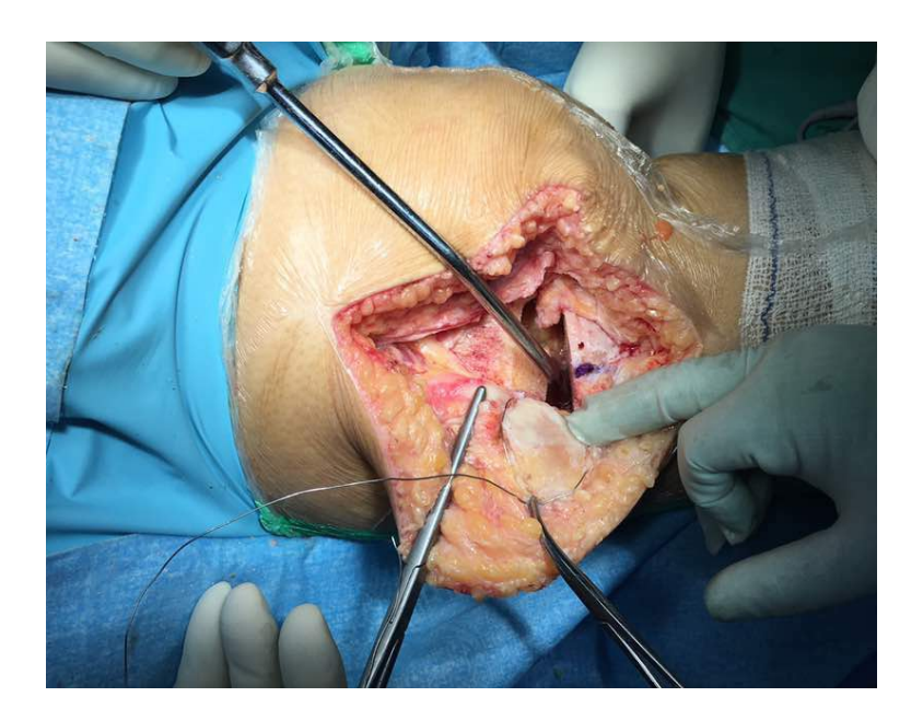
Figure 2 : Circumference patella measurement using circlage wire.

Figure 1 : Measurement of patella dimensions using caliper.