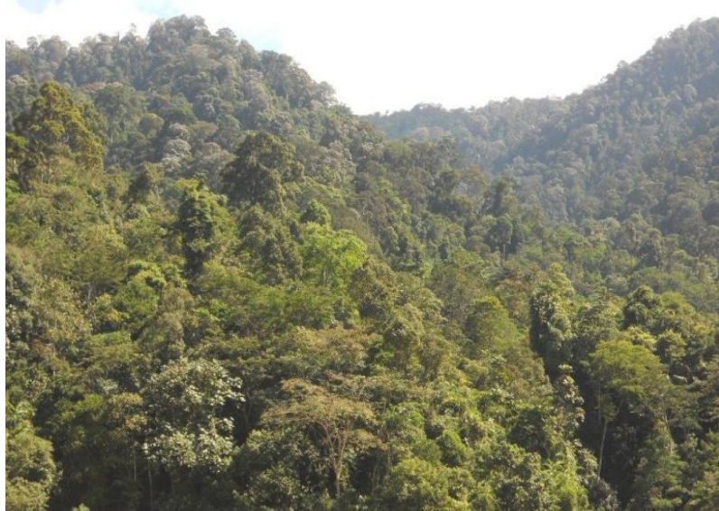
Figure 1.2(a) Dense forest area

Barren land has been defined as non-vegetation cover area consists of road, soil, sand, and rocks. The sand mining activities and Simpang Pulai to Cameron Highland road in study area are mostly contributed to barren land area.