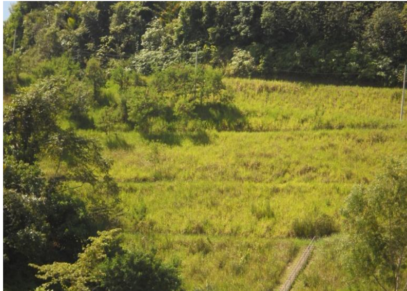
Figure 1.2(c) Rangeland area with mixed vegetation