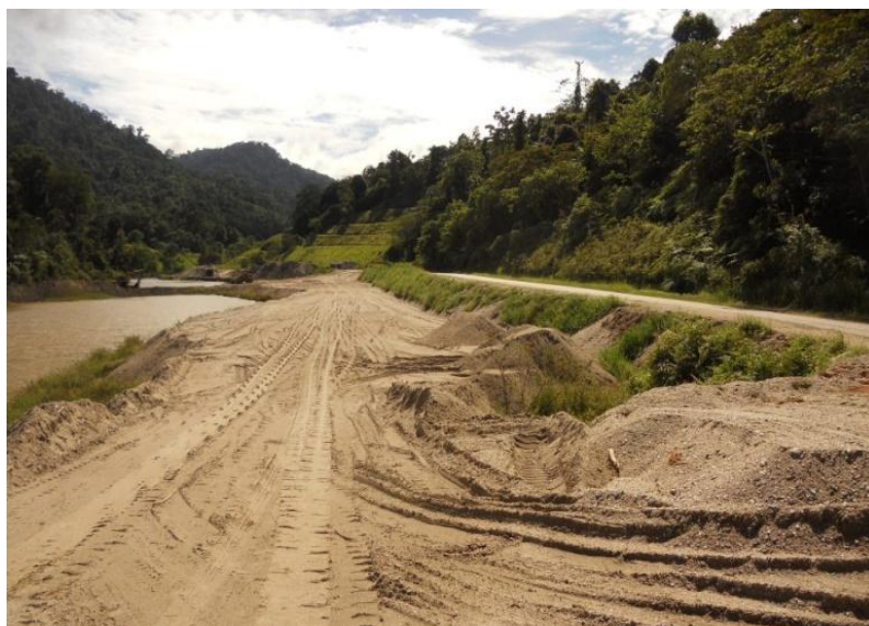
Figure 1.2(d) Barren land area in sand mining sites route