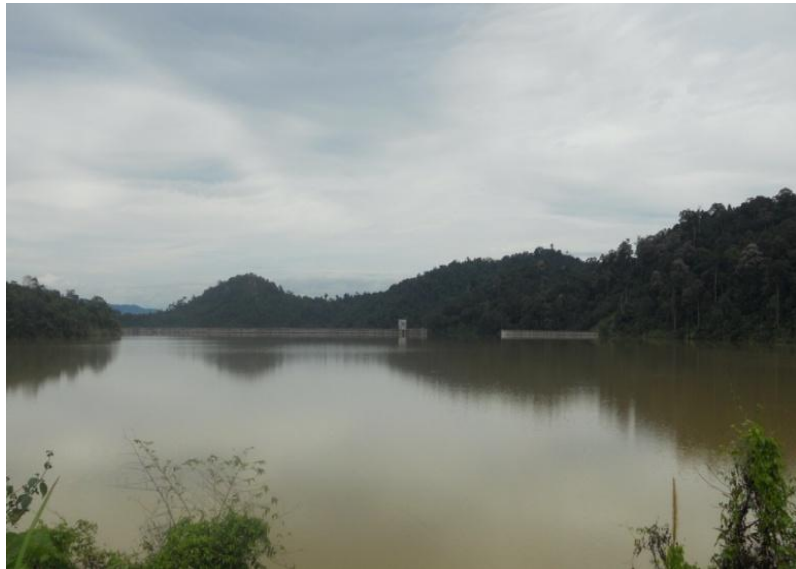
Figure 1.2(b) SASD reservoir