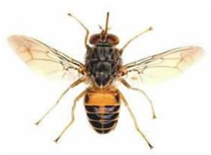
Figure 2.3: The Tsetse fly