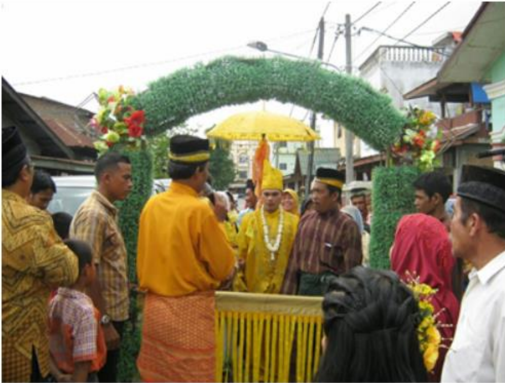
Picture 1: Welcoming groom in the session of Hempang Batang ( https://ichwankalimasada.wordpress.com )

Being one of tools to show politeness, pantun is bound by some generic rules. It consists of four lines in each stanza, lines one and two are sampiran (introduction) and lines three and four are isi (message or objective) of pantun, which in this study refers to various speech acts.