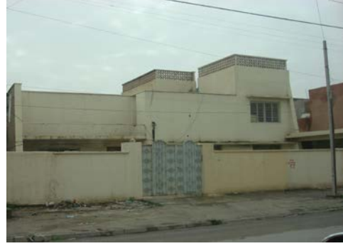
(b) A House in Azady Sector-Erbil city.