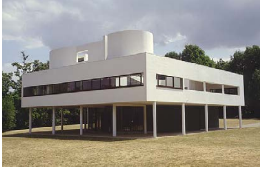
(a) Villa Savoy (International)