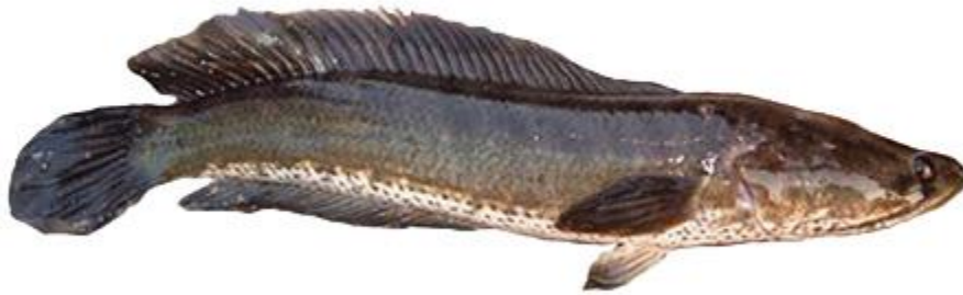
Figure 1: Channa striatus (Haruan Fish)

Channa Striatus is a fresh water species which also known as snake head fish or known as Haruan in Malay. It is indigenous species to many tropical countries such as India, Thailand, Malaysia, and Indonesia. It belongs to Channidea family and it is carnivorous fish.