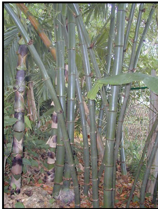
Figure 2.1: Bambusa blumeana ( http://www.germanlipa.de/garten/pflanzenb.htm ).

A tall, thorny bamboo originates from India and Indonesia. It is also known as “Thorny Branch Bamboo” because of the thorns around lower branches (Figure 2.1) ( http://www.germanlipa.de/garten/pflanzenb.htm ). It is a type of clumping with 15 m height and 10 cm in thickness. It is equally effective as a living fence. The culms are strong and straight. Applications are use for fence, furniture, construction, baskets, and edible shoots