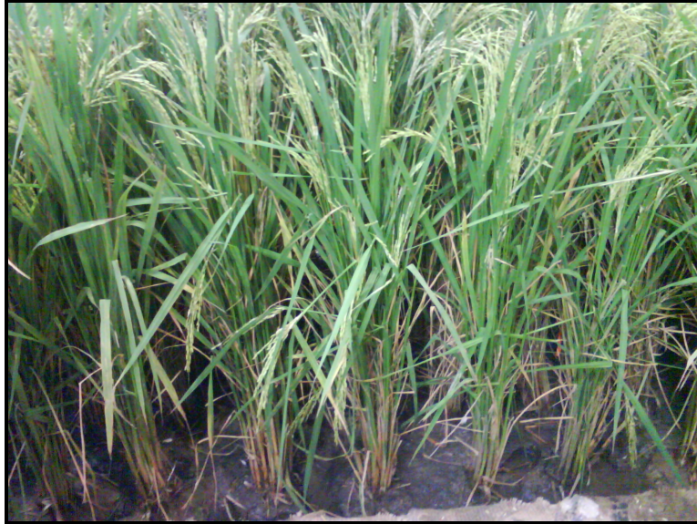
Figure 2.3: Rice straw (Ireana Yusra and Abdul Khalil, 2009).

Rice straw also has a high content of cellulose and hemicellulose (about 70%) with energetic values similar to those of corn. Unfortunately, these carbohydrates have no values either as animal feeds, since they are hardly digested by ruminants and cannot be digested by single gutted animals and humans or as feedstock for sugars production because of a very low conversion if they are not chemically and physically pretreated.