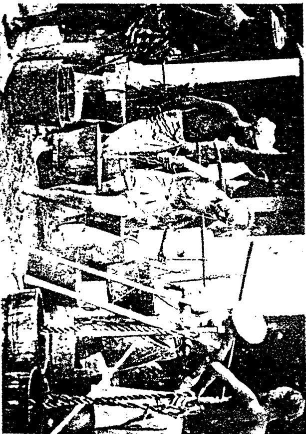
1b Tamil water-carriers