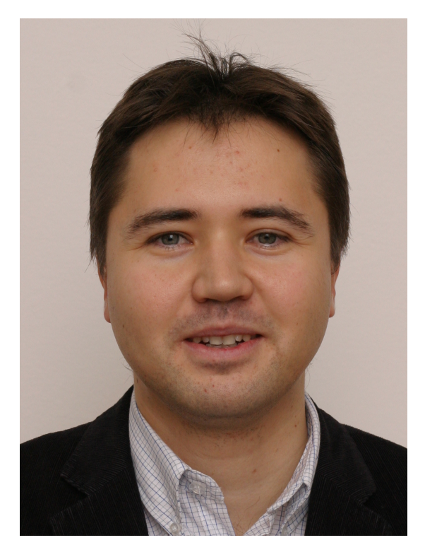
Figure 1.2: Frontal pose image from SCface database (Grgic et al., 2010).

Face detection and recognition in video based surveillance system is more challenging than normal face detection and recognition system that utilizes photo-realistic images (Lei et al., 2009; Wheeler et al., 2010; Ho et al., 2003; Lee et al., 2005). Figure 1.2 shows a sample of frontal pose photo-realistic image from the Surveillance Camera Face Database (SCface) database. The challenges of using commercialized surveillance cameras are the images taken using these cameras are low in frame rate, and low in resolution, but high in noise. The detection and recognition are even more difficult when added with known problems in computer vision such as changes in facial appearance, pose variations, occlusions, uncontrolled lighting conditions, and changes in facial expression. Figure 1.3 shows the facial images captured by a Pan-Tilt-Zoom (PTZ) surveillance camera over a few minutes at 10 - 20m range outdoors. The effect of pose variation, illumination variation, and blurring that can occur when imaging non-cooperative subjects can be observed clearly in this figure.