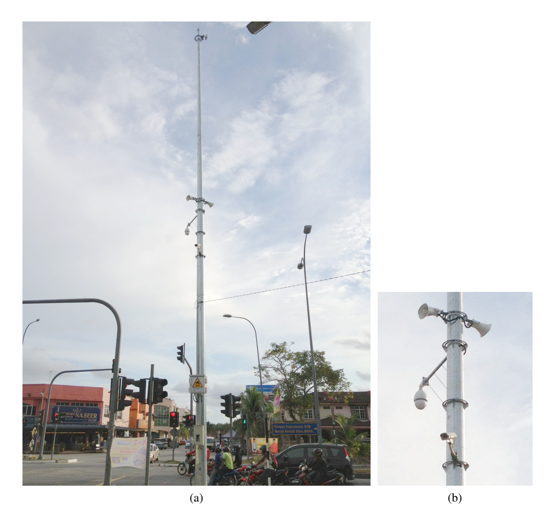
Figure 1.1: Surveillance cameras installed at traffic light junction in Malaysia: (a) surveillance cameras installed at the middle section of the pole; (b) close up view of the surveillance cameras.

Visual surveillance in dynamic scenes has a wide range of potential applications, such as a security guard for communities and important buildings, traffic surveillance in cities and expressways, detection of military targets, etc. (Hu et al., 2004). With the never ending of crime over the nations, law enforcement agencies are starting to look into the possibilities of automated detection and recognition of criminals or suspects in public space, where the face of the suspects might be caught by the surveillance cameras, in order to reduce the crime rate. Figure 1.1 shows the surveillance cameras that are installed at a traffic light junction in Malaysia.