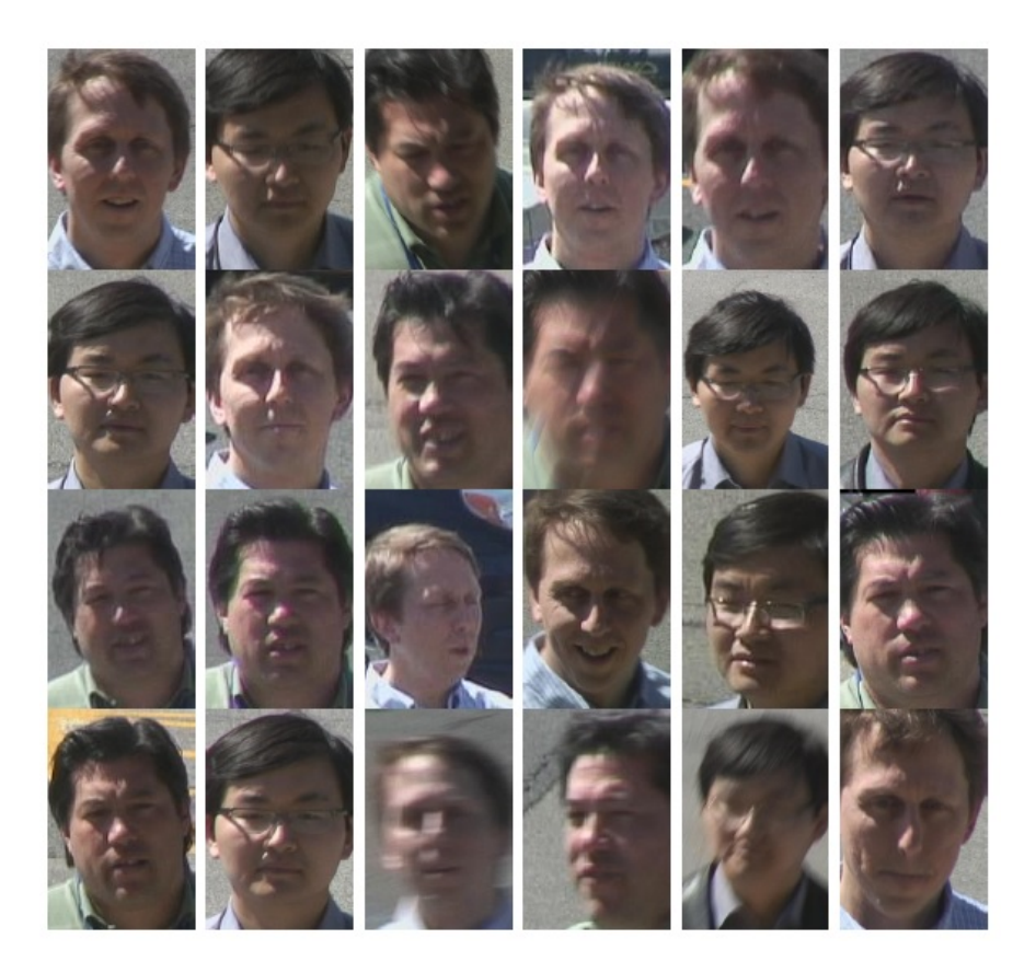
Figure 1.3: Facial images captured by a PTZ surveillance camera over a few minutes at a 10-20m range outdoors (Wheeler et al., 2010).

Vapnik (1998) and his co-workers proposed Support Vector Machine (SVM) as a very effective method for general purpose pattern recognition. Given a set of points belonging to two classes, SVM finds the hyperplane known as the Optimal Separating Hyperplane (OSH) that separates the largest possible fraction of points of the same class on the same side while maximizing the distance from either class to hyperplane, which in turn minimizes the risk of misclassifying not only to the examples in the training set but also the unseen examples of the test set (Guo et al., 2000).