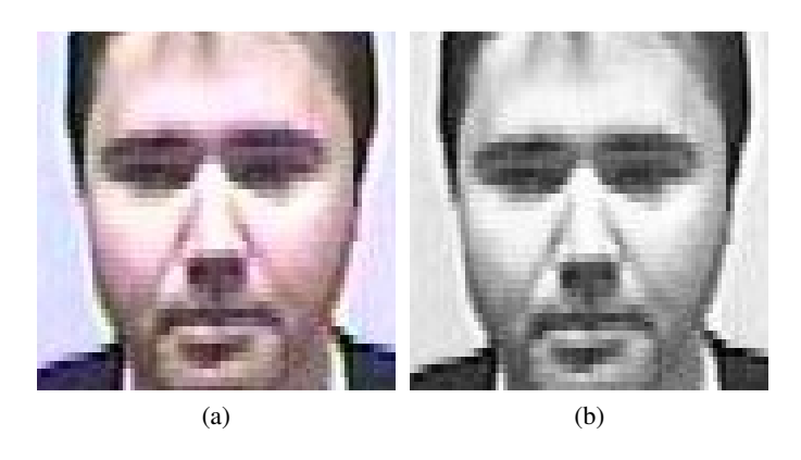
Figure 2.1: RGB to grayscale conversion: (a) RGB face image; (b) Grayscale face image.

Alternative color space conversions include Hue, Saturation, Lightness (HSL) and Hue, Saturation, Value (HSV) color space conversion, whereby the grayscale image is obtained by taking only the lightness of HSL color space or value of HSV color space.