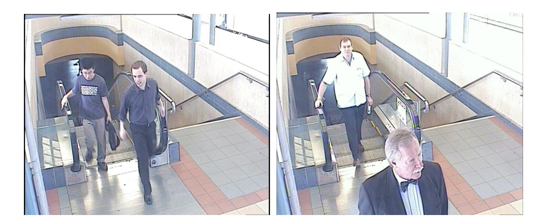
Figure 1.4: Examples of typical face pose under surveillance conditions (Lovell et al., 2008).

The most interesting application domain of face recognition in surveillance system is face recognition in public surveillance. Video surveillance system contains rich information that can be used to aid police investigation, e.g. vehicle type, vehicle number plate, the process of a certain incident, face of the suspects, etc. For application that needs identity recognition, face is the most important feature that can be used from video surveillance system. As mentioned in Section 1.1, face recognition in surveillance system belongs to non-cooperative system, in which the system can operate without the subject's active participation and conscience (as shown in Figure 1.4). The automated face recognition system can then search for the identity or watch list of the suspect from a database that comprises of millions of subjects.