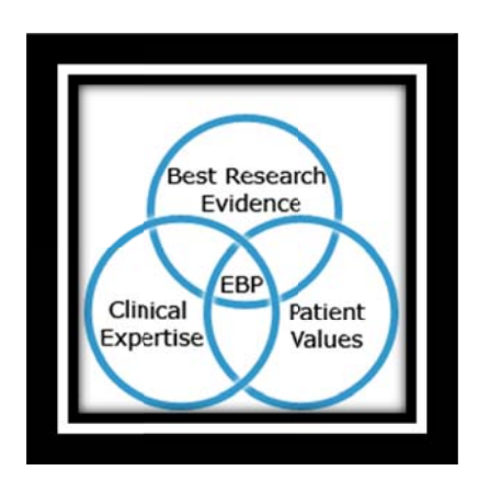
Figure 2.1.1: EBP is the integration of clinical expertise, patient values, and the best research evidence adopted from Sackett (2002)

The figure below showed that EBP is the combination of clinical expertise (cumulated experience, education and clinical skills), patient values, and the best research evidence in decision making process for patient care. Sound methodology in clinically relevant research would provide the best evidence (Sackett, 2002).