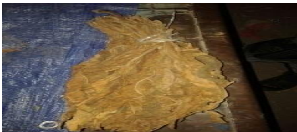
Figure 1.2 Sun-dried toombak