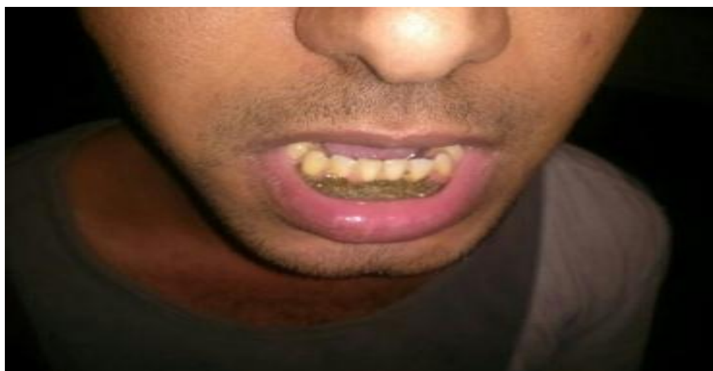
Figure 1.3 Shammah in the lower labial vestibule of the oral cavity