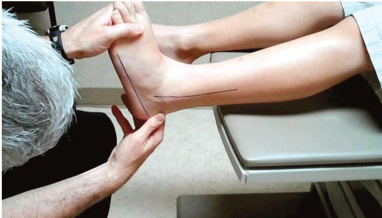
Plate 4: Evaluation of the ankle joint dorsiflexion with the knee in full extension (Adopted from McGlamry's Comprehensive Textbook of Foot and Ankle Surgery)

flexed and extended, then it can either be gastroc-soleus equinus or osseous equinus. This is determined by the quality of the end range-of-motion and with a charger dorsiflexion stress lateral ankle x-ray. A soft end range of-motion is more likely a gastrocsoleus equinus, especially if no anterior ankle impingement is noted on the x-ray.