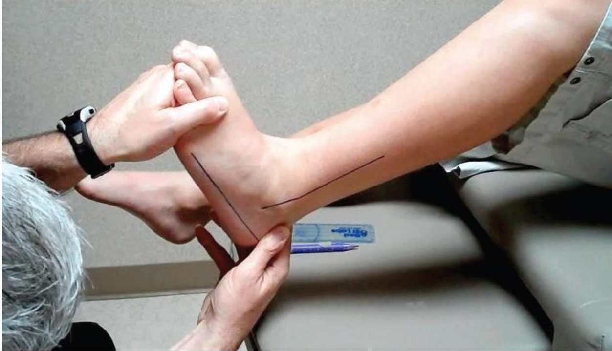
Plate 5: Evaluation of the ankle joint dorsiflexion with the knee flexed (Adopted from McGlamry's Comprehensive Textbook of Foot and Ankle Surgery)