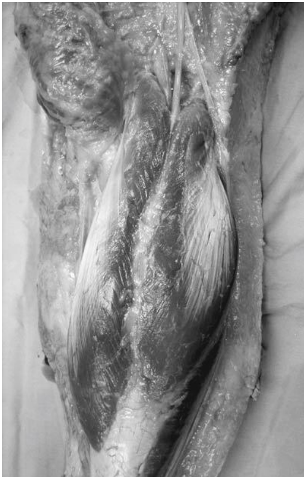
Plate 1: Posterior view of the gastrocnemius muscle comprising of its lateral and medial head. (Adopted from Surgical Reconstruction of Foot and Ankle, Thomas Zgonis)

The muscle fibers from each head run obliquely and attach at an angle in the middle of the calf into a midline raphe that further distal broadens into an aponeurosis on the anterior surface of the muscle. This aponeurosis gradually narrows and unites with the tendon of the soleus to form the Achilles tendon. The gastrocnemius is innervated by the first and second sacral roots through the tibial nerve.