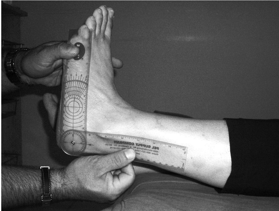
Plate 3: The technique of measuring ankle range of motion using a goniometer. (Adopted from Surgical Reconstruction of Foot and Ankle, Thomas Zgonis)

considered normal when the patient to be able to reach a 90 degree angle between the two lines plus an additional 10 degrees.