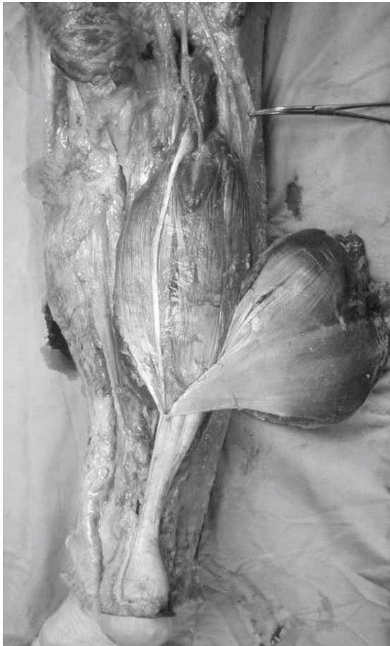
Plate 2: Soleus muscle seen here after the gastrocnemius muscle is detached from its origin(Adopted from Surgical Reconstruction of Foot and Ankle, Thomas Zgonis)

two muscles, with a more distal fusion resulting in more rotation. This rotation makes elongation and elastic recoil within the tendon possible and allows the release of stored energy during the appropriate phase of gait. This stored energy allows the generation of higher shortening velocities and greater instantaneous muscle power than could be achieved by contraction of the gastrocnemius and soleus muscles alone. Fiber rotation reaches a maximum 2 to 5 cm proximal to the tendon insertion and creates high stresses in this area of the tendon, which may explain the poor vascularity and susceptibility to degeneration and injury in this region.