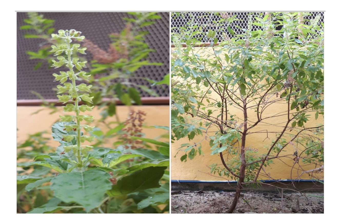
Figure 2.1: Ocimum sanctum

Ocimum sanctum (OS) (figure 2.1) also known as Ocimum tenuiform (OT), tulsi or holy basil from the family of Lamiaceae has been widely used for thousands of years in Ayurveda and Unani system to cure or prevent a number of illness such as headache, malaria fever, ulcers, bronchitis, cough, flu, sore throat and asthma (Jung et al. , 2002). Tulsi, the 'Queen of herbs' can be divided into three types; Rama/light tulsi (OS), Shyama/Dark tulsi (OS) and Vana tulsi (OT) which have similar chemical properties and medicinal values.