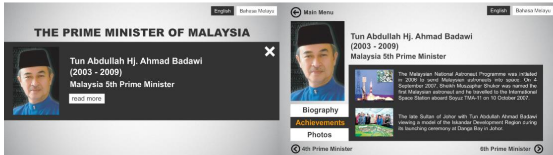
Figure 4. Modified pages of “The Prime Minister of Malaysia”

The application was redesign using Adobe Flash software. It was designed according to previous application layout, which is 1920 by 1080 pixel screen. Some requirements are set for the proposed design by combining design elements and design principles to create the prototype. Simplicity is one of the main design principles for this prototype as the interface must be comfortable to read and easy to use or navigate. Secondly, consistent interface helps users get comfortable with the application in a short time. The main menu is made clear for visitors to avoid clustered screens and allow them to navigate in better depth. Therefore, visitors can select and understand other prime minister's information in a very short period of time.