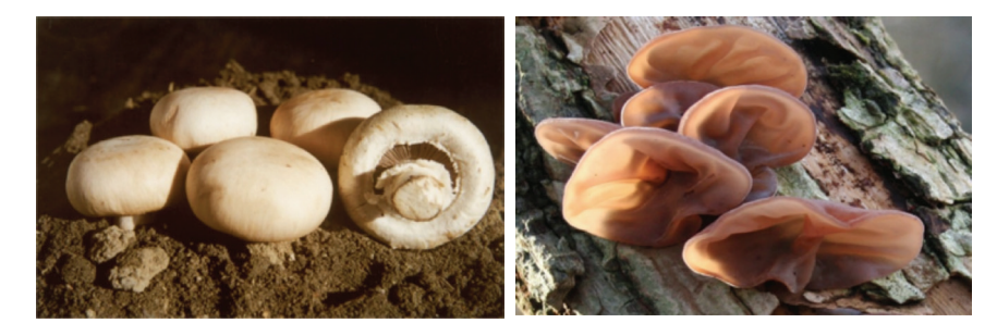
Agaricus bisporus (Button mushroom)