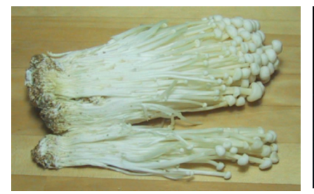
Flammulina velutipes (Winter mushroom)