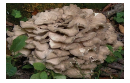
Grifola frondosa (Maitake mushroom)