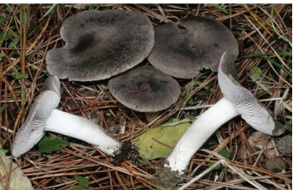
Tricholoma terreum (Grey-capped mushroom)

Figure 7.1 Most common cultivated edible mushrooms worldwide