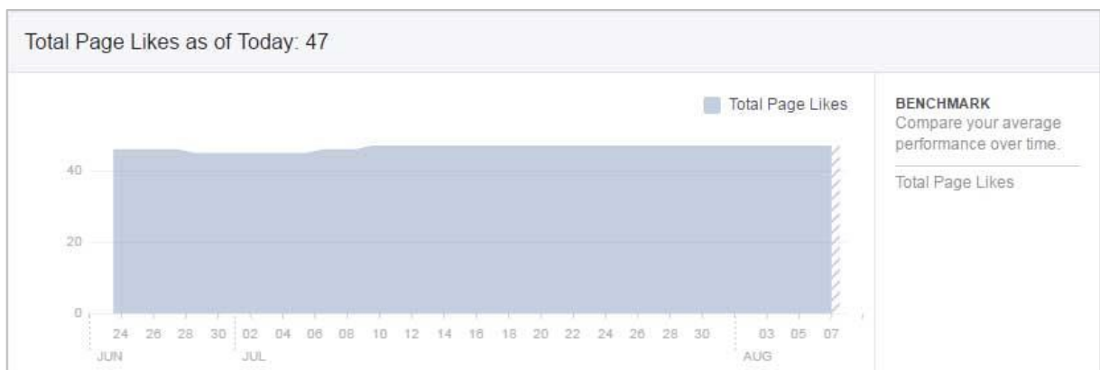
Figure 4: Total page likes