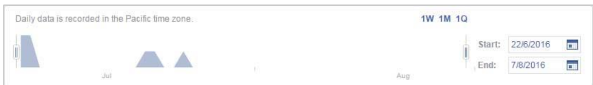
Figure 3: Daily data recorded

Overall, the results from this study show that the reaction from the respondents was positive in term of acceptance in understanding the visual images presented to them. In Figure 3, shows that the survey started on 22.6.2016 and ended on 7.8.2016. Daily data is recorded in the Pacific Time zone. During this period, 47 Likes (Figure 4) has been recorded by the Facebook application. In Figure 5, Net Likes comprising Unlikes, Organic Likes and Paid Likes shows the numbers of new likes minus the number of unlikes. Figure 6, shows the All Post Published engagement between the respondents and the visuals. Safety Category shows 18 respondents have been reached and 4 engaged with the visuals. Self-Injurious category shows 21 respondents have been reached and 5 engaged with the visuals. Total of 18 people was reached and 4 engaged in Sensory Issues category. In Motor Issues category, they were 20 respondents have been reached and 4 engaged with the visuals. Category of Bizarre Repetitive Behaviour shows 17 respondents was reached and 4 were engaged. Communication Issues recorded 15 respondents was reached and 3 was engaged. In Social Issues category there were 17 respondents was reached and 4 was engaged.