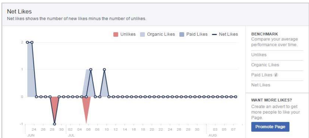
Figure 5: Total Net likes