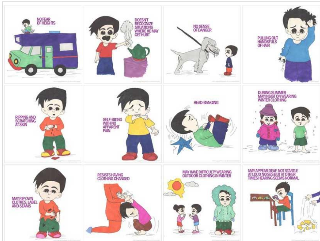
Figure 1, visual images of autism behavioural symptoms