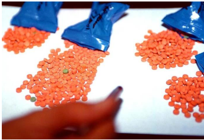
Figure 1.2: ATS tablet that commonly used in Kelantan region

Amphetamine in acute phase may inhibit the reuptake of Dopamine, Norepinephrine, and Serotonin by membrane transporters and increase this level of this neurotransmitter in the brain and it will then result in depletion of dopamine transporter and this will give impairment in their neuropsychological functioning (Logan, 2002; Camí, & Farré, 2003; Nordahl, Salo, & Leamon, 2003; Fernández-Serrano, Pérez-Garcia, & Verdejo-Garcia, 2011).