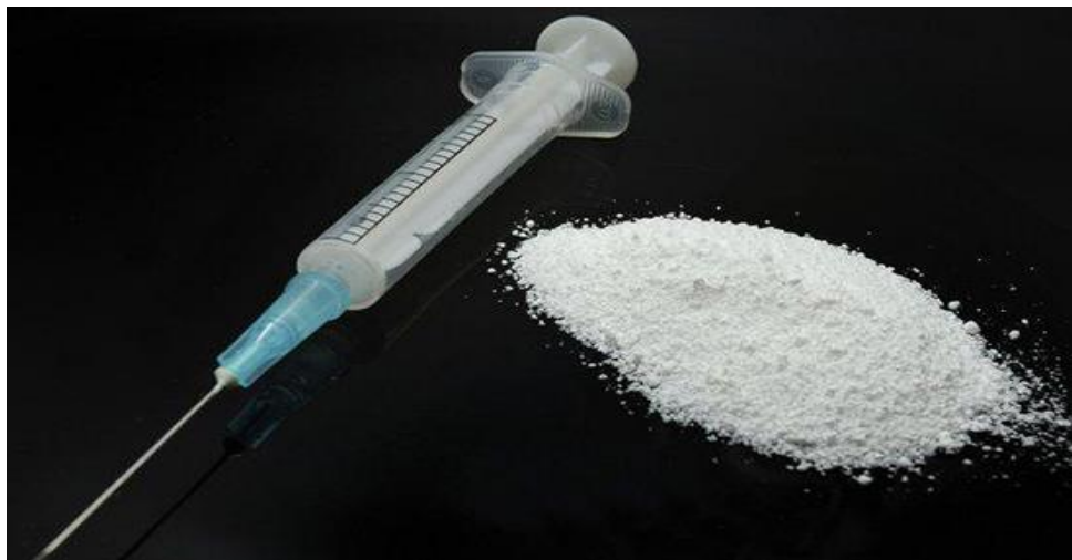
Figure 1.1: Heroin Powder and Common Route of Administration Using Syringe

and Buprenorphine (Whelan & Remski, 2012). Also, some cognitive behavioral therapies (CBT) are recommended as part of treatment. CBT is the process of identifying negative pattern of thought which will influence one's behavior. The negative thought patterns always play a main role in development of addiction (Kimmel, 2015). Examples of CBT techniques used in addiction treatment include pleasant activity schedule which may help recovering addict to make a healthy weekly list including fun activities that may break up daily routines. This may help reduce negative automatic thoughts and the subsequent need to use drug. (Addiction Center, 2015).