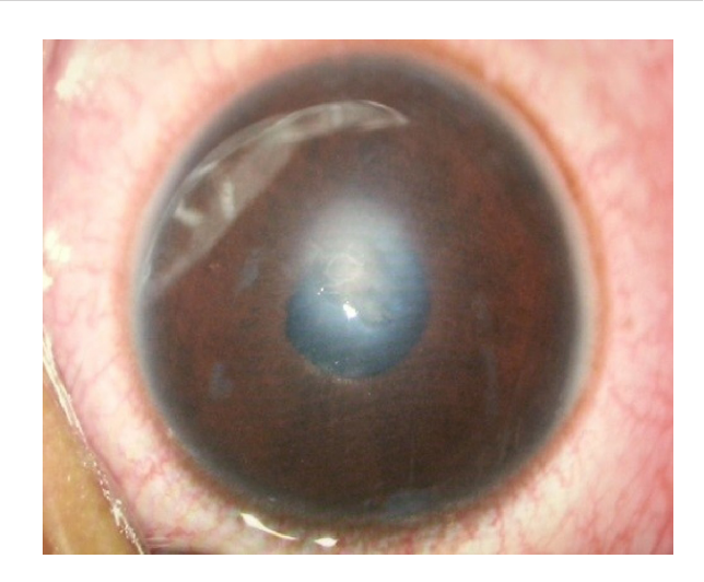
Figure 2 Right eye showing full thickness corneal laceration wound centrally with fibrin clumps in the anterior chamber located superotemporally.

He was then diagnosed as having a right eye full-thickness corneal laceration wound with severe traumatic uveitis secondary to trauma. He underwent right eye examination under general anesthesia, and the corneal laceration was repaired with 10/0 nylon sutures.