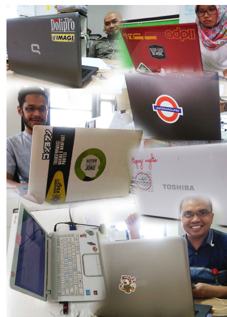
Figure 1. Stickers on laptop phenomenon in Telkom University.

“Attractive, Colorful, and Fun” Because of their prefabricated laptops are way too boring for them?