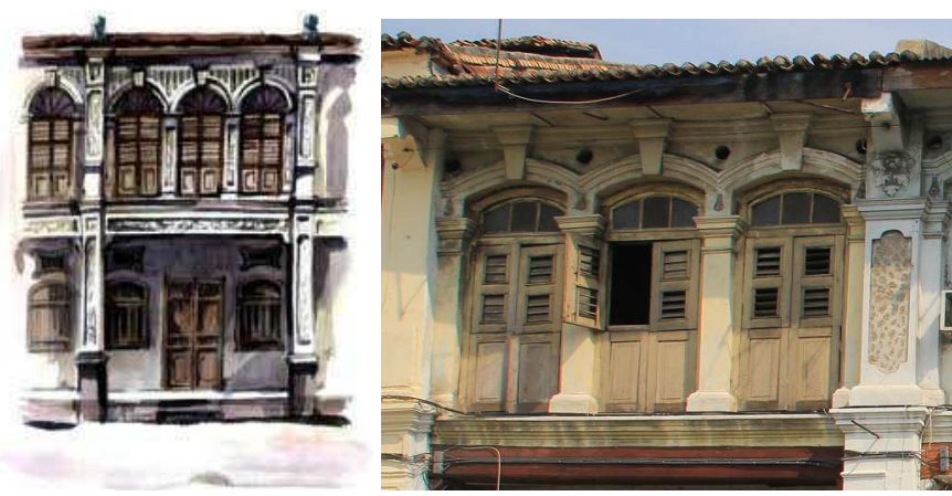
Figure 3. Facade of shop houses of Early Straits Eclectic Style

metrical double doors, a pair of window and bat shape vents above. The style incorporates many of the features of the 'grand' classical style, reinterpreted and adopted to suit the vernacular shop houses that may include pediments, pilasters, keystones and arches. From the 1910's, the use of reinforced concrete allowed wide roof overhangs and more elaborate cantilevered concrete decoration (consoles). This style exhibits almost exclusively a bipartite elevation order, i.e. elevation with two windows. Structurally, buildings of this style incorporate extensive use of masonry with the introduction of reinforced concrete lintels and beams, timber upper floor and tiled roofs [6]. Figure 3 demonstrates the facade of shop houses of Early Straits Eclectic Style