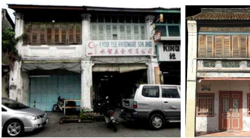
Figure 1. Facade view of shop house of Southern China style

first sultan married a princess from China. The Malaysian Chinese population is descended from the immigrants from the southern provinces of China [2]. They consist of several different clans including the Hakkas, Foochows, Hainanese, Teochius and Cantonese. During the British period in the early 19th century, the Chinese, who came to Malay Peninsula via Penang, Malacca and Singapore, were employed in tin mines and rubber estates. Some of them were hired in trades, as craftsmen and skilled mechanics, while others worked in sundry shops as shopkeepers [3]. Due to the discovery of tin fields between 1850 and 1870 in some parts of Perak and Selangor states, plus the increasing demand for tin ore in tinplate industry in Europe; a large number of them drastically, drifted to work in tin mines. The architectural tradition followed was a modified version of the "Chinese National". This is manifested in the symbolism of the ornaments that are used to convey luck, directions, seasons, the wind and constellations. The fundamental concept of design is courtyard, emphasis on the roof, exposure of structural element and colouring their building, floor finishes and others [4]. Normally the structure on this type of shop houses are plastered with lime and the roof structure are of timber. Figure 1 shows the façade view of shop house of Southern China style.