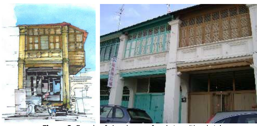
Figure 2. Facade of shop house of early transitional style

The two storey structures are built to the street edge and incorporate a five foot pedestrian walkway which is subsequently known as 'five footway' and is well entrenched in the style by the middle of the nineteenth century. Expressive gable ends to rows. Ornamentation is minimal with the upper consoles often enlarged and decorated with floral motifs, simple decoration to the spandrel. Green glazed ceramic vents) and plain pilasters [5]. The usual orders adopted are the Tuscan and Doric. Upper floor openings, with a row of continuous timber shutters are common. Cornices or horizontal mouldings along the beam make the structure appear heavy. Structurally, buildings of this style incorporate the use of masonry dividing walls with timber upper floor, tiled roof and timber beam. Figure 2 illustrates the facade of shop house of early transitional style