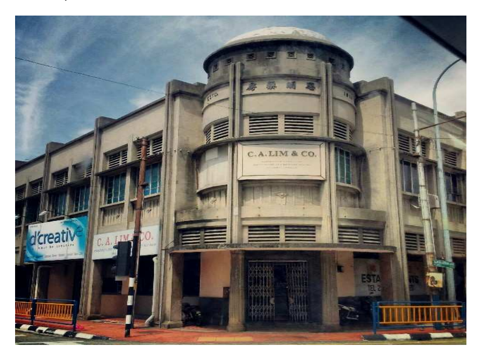
Figure 6. Facade of shop house of Early Modern style.

adapted to form a unique modern style. Structurally, the buildings of this style use reinforced concrete. Figure 6 demonstrates the facade of shop house of Early Modern style.