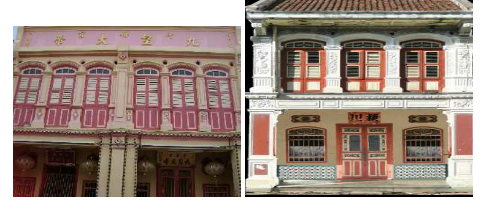
Figure 4. Facade of shop house of Late Straits Eclectic style.