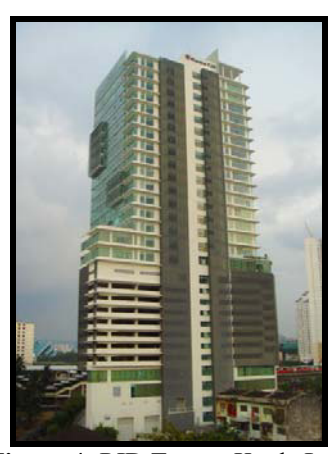
Figure 4: PJD Tower, Kuala Lumpur.

With 28 storey high, this commercial and office tower consisting of 5 floors of commercial podium and 8 floors of car park located at Jalan Tun Razak, Kuala Lumpur was completed in year 2010. Near to the Titiwangsa LRT Putra and monorail. This building is owned by the PJ Developer Holdings Berhad and the anchor tenant for this building is JKR- Cawangan Kerja Bangunan Am. The management for this building is PJD itself. For mean of fire risk and hazard for this building, there is no specific organisation chart that control or manage the fire drill. The fire drill had been practiced once a year in this building.