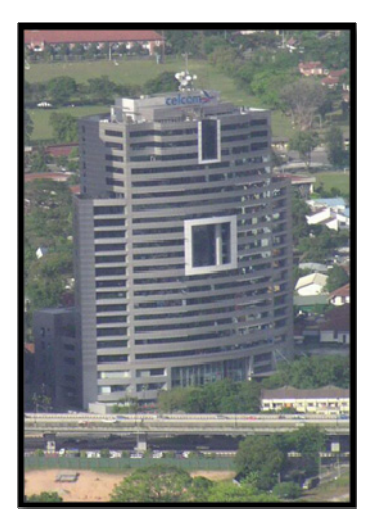
Figure 5: Celcom Tower, Kuala Lumpur

This Celcom building is 22 stories high with basement parking, office space and commercial space where it has been Celcom Axiata Berhad Kuala Lumpur headquarters since 2002. This building was formerly known as Wisma Telekom JalanSemarak and is next to Marinara Tower (Menara 238) and opposite to the Wisma Perkeso. The fire drill has been practiced twice a year in this building with the supervision of Balai Bomba Hang Tuah and Balai Bomba Maharajalela. However, there is no specific organization or team act as ERT.