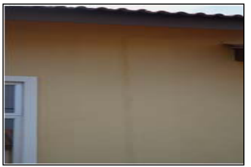
Fig. 3: Vertical cracks on external wall