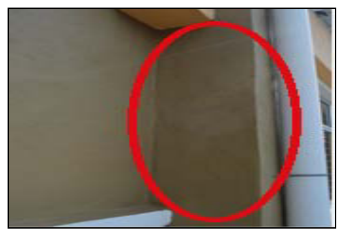
Fig. 4: Diagonal cracks on column area

Figures 1-6 show the existence of vertical and horizontal cracks on external walls and columns as well as peeling paint at a low-cost terrace house and a low cost flat. Cracks, whether they be vertical, horizontal or diagonal, that occur on the structural elements of a building such as walls and columns are common symptoms of structural instability. This might happen due to poor design and workmanship during construction. On the other hand, there were many causes of peeling paint. One of the causes of this is the use of unsuitable types of paint for application on external walls. External walls are the part of a building that is most vulnerable to exposure to harsh weather conditions. Therefore, it is very important to use good quality of paint for such surfaces.