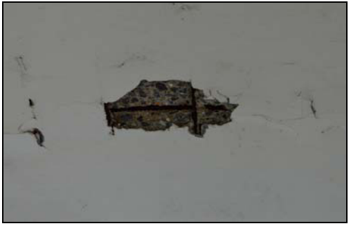
Fig. 8: Concrete spalling underneath the floor slab