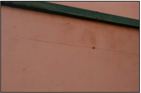
Fig. 5: Plaster cracks on external wall