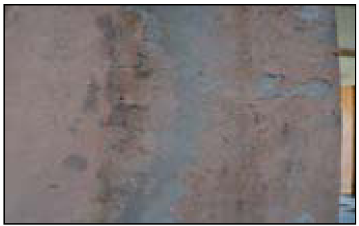
Fig. 6: Severely peeling paint on external wall