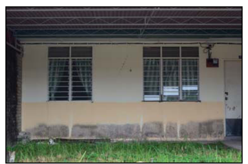
Fig. 2: Peeling paint on external wall