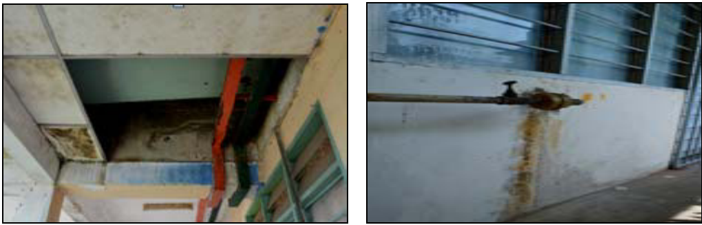
Fig. 9: Broken suspended ceiling