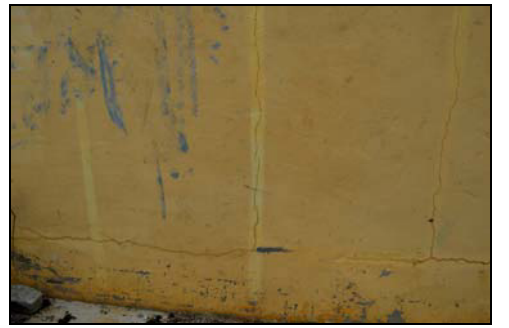
Fig. 1: Vertical and horizontal cracks on outer wall