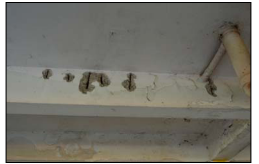
Fig. 7: Concrete spalling on beam area