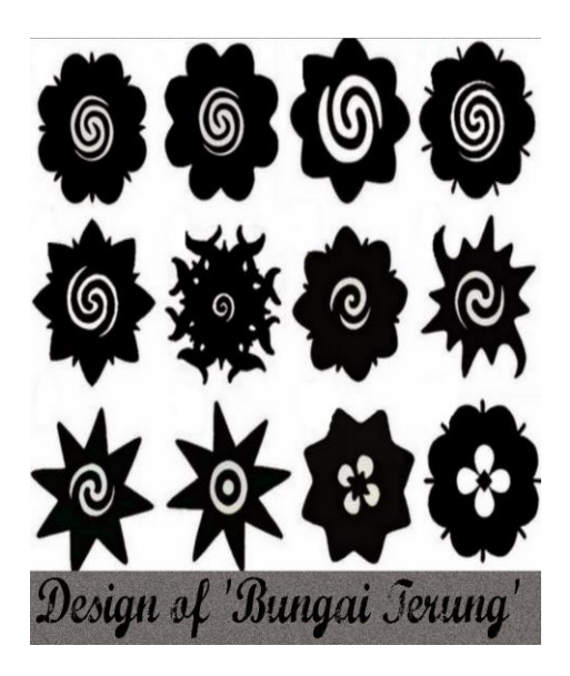
Figure 4: Variation of bungai Terung Motif.

This topic is deliberately chosen in response to the insistence on personal experience of researcher who feel the need to highlight this subject to the attention of the general public. Its main aim is to educate the general public that each motif applied on any objects associated with the material culture of the Dayak people should be handling with certain degree of respect.