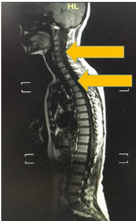
Figure 1 Linear signal hypointensity from C2 to C6 and T2 to T9 vertebra level on T1 weighted imaging (arrow).

A diagnosis of left retrobulbar optic neuritis was performed. She was started on intravenous methylprednisolone at a dosage of 250 mg four times a day for a period of 5 days,