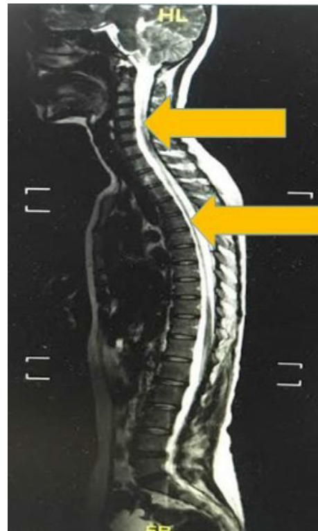
Figure 2 Linear signal hyperintensity from C2 to C6 and T2 to T9 vertebra level on T2 weighted imaging (arrow).

followed by oral prednisolone at a dosage of 45 mg (1 mg/kg/day) once daily for 9 days. Her condition dramatically improved after treatment. Visual acuity of her left eye was 6/24, and her optic nerve functions improved. She was continued with oral prednisolone with tapering dose weekly for another 1 month. Her visual acuity improved to 6/6 with good optic nerve functions. Oral prednisolone was off after 2 months. There was no complication due to the use of corticosteroids. Her vision remained good during 6 months follow-up.