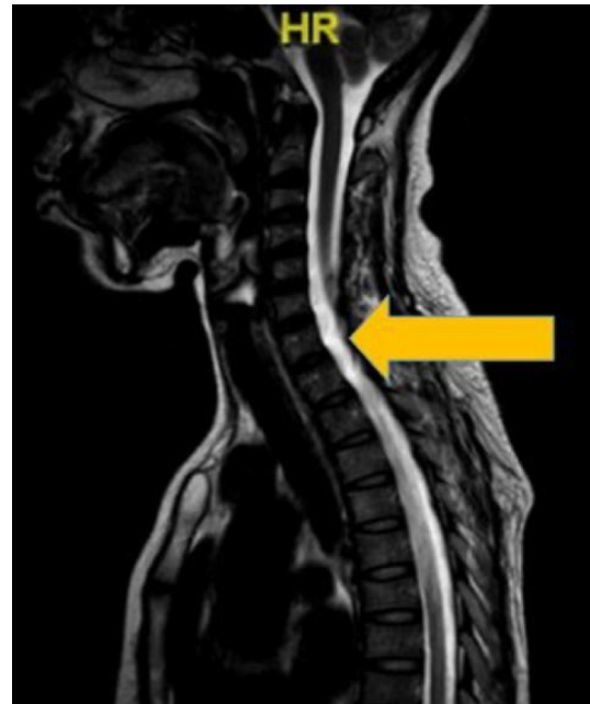
Figure 5 Linear signal hyperintensity from T3 to T6 vertebra level on T2 weighted imaging (arrow).

She was diagnosed with syringomyelia with right optic atrophy. She was started on intravenous methylprednisolone at a dosage of 250 mg four times a day for 5 days, followed by oral prednisolone at a dosage of 40 mg (1 mg/kg/day) once daily for 9 days. Her condition improved after 2 weeks of treatment, with reduction in the right eye central scotoma. However, due to the preexisting optic atrophy, visual acuity in her right eye was 6/9. Her optic nerve functions persistently reduced compared to her left eye. She was continued with oral prednisolone with tapering dose weekly. Subsequent follow-up at 1 month after diagnosis showed that her ocular condition