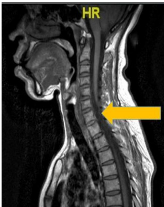
Figure 4 Linear signal hypointensity from T3 to T6 vertebra level on T1 weighted imaging (arrow).

was stable. Her limb weakness improved slightly, but she remained wheelchair bound. There was no complication of treatment. Her condition was stable at 6 months follow-up.