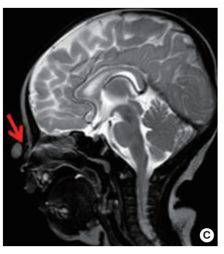
(A, B) Stalk of the lesion passing in between the nasal bone and upper lateral cartilage. (C) Small fine stalk in a T2-weighted magnetic resonance imaging (shown with a red arrow).