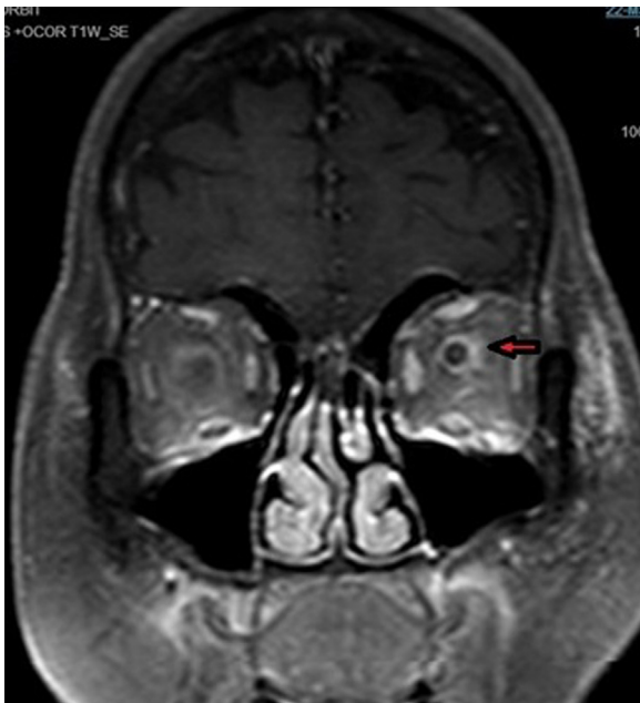
Fig. 3. Brain MRI shows abnormal enhancement of the perineural sheath of the left optic nerve.

trabeculitis. Unfortunately, she developed hyphema and orbital apex syndrome two weeks later. These complications can occur immediately, weeks later or months to years after the cutaneous eruption.