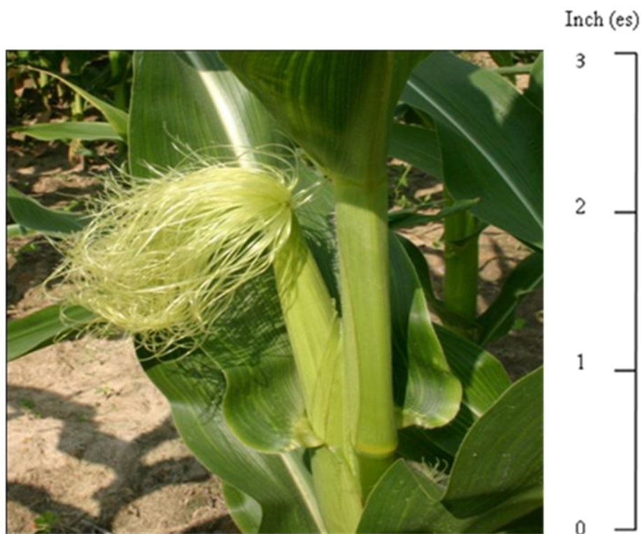
Figure 2.2 The emergence of corn silk in a corn farm located at Tendong, Pasir Mas, Kelantan. (Scale: 1 inch to 7 cm).

The ears are female inflorescences, tightly layered by soft husk and covered over by several layer of leaves (Figure 2.2). The ears hardly showed themselves until the emergence of the pale yellow silks at the end of the husks. The silk are elongated stigmas that resemble a bunch of hair. It is a green colour and then red or yellow at the edge of the stigmas. The thread of fresh stigmas is 10 to 20 cm length with light green or yellowish-brown in colour and diameter ranging from 654 - 627 \mu\text{m} (Wan Rosli et al. , 2010).