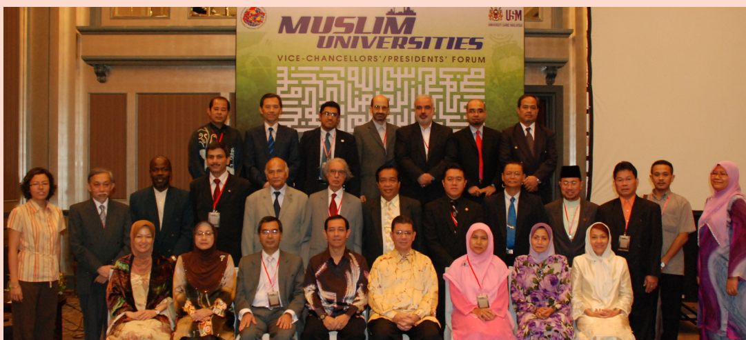
The forum participants.

Overall, MUVCF achieved its objectives with the conclusion that it will continue its effort in constructing models that will inspire universal and Islamic values.