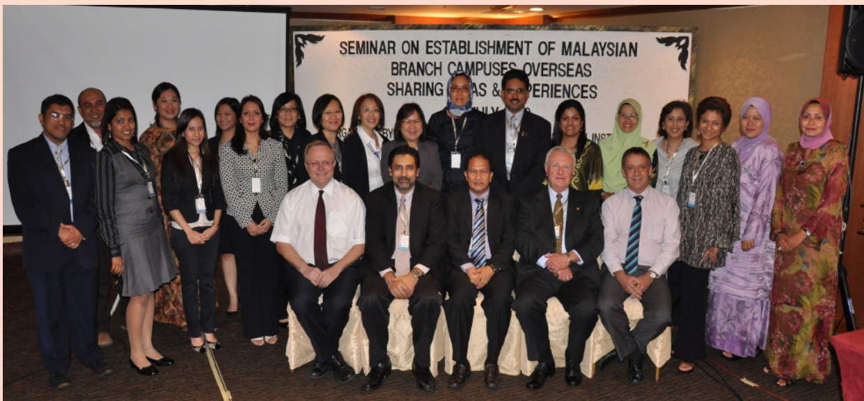
Research members and seminar participants.

The seminar became a good discussion and idea sharing session. It was also very useful and informative for the research team which would add towards making the ongoing research a success.