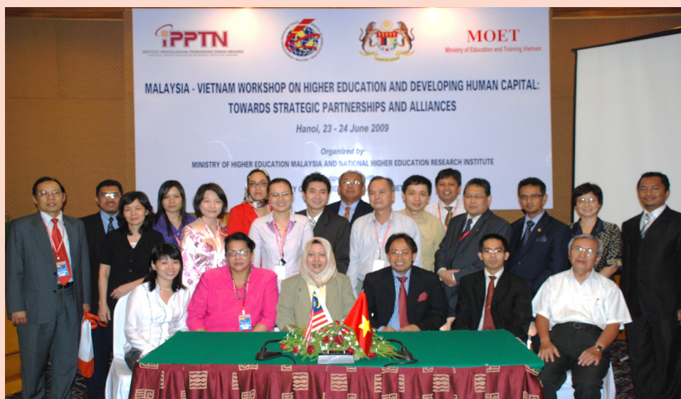
Delegates and participants of the Malaysia-Vietnam Strategic Dialogue in a group photograph.

In Lao PDR, a lot of emphasis was stressed on training in specific areas such as medicine, health science, engineering, tourism, entrepreneurship, leadership, e-learning, English and information technology. Lao PDR has young and inexperienced personnel who need training which Malaysia can provide. Short courses, attachment schemes and training were suggested for officials from Lao PDR which involve Malaysian higher education institutions and government offices.