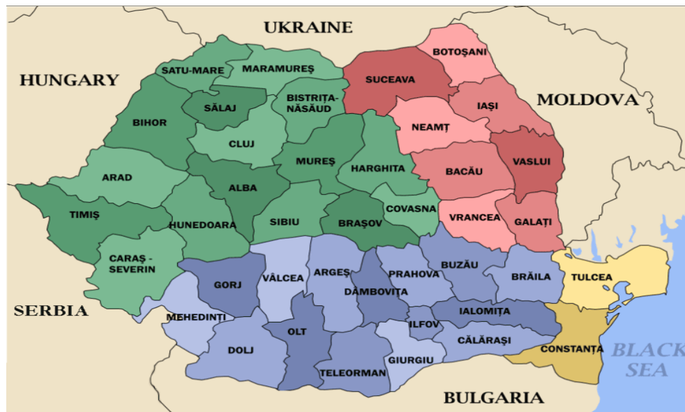
Figure 1. Romania map ( http://www.perfect-tour.ro/imagini/harta_romania.png )

represent an essential part of Romania's richness and the exploitation of these resources, both renewable and non-renewable raw material, and their transformation into goods, determines the social and economic development of the country, environmental status and living conditions of the population. In order to contribute to the quality of life in Romania, natural resources need to be exploited in a sustainable manner (Macoveanu, 2005a; Macoveanu, 2006; Negulescu and Ianculescu, 2005). The government programme lays down three basic principles for Romania's environment policy, according to European and international law: ensuring the protection and conservation of nature, the protection of biological diversity, and the sustainable use of their components. An important problem in Romania as regards environmental protection is the management of waste. This notion covers activities of collection, transport, treatment, recovery and disposal of waste (Nicu, 2001; SOP, 2006).