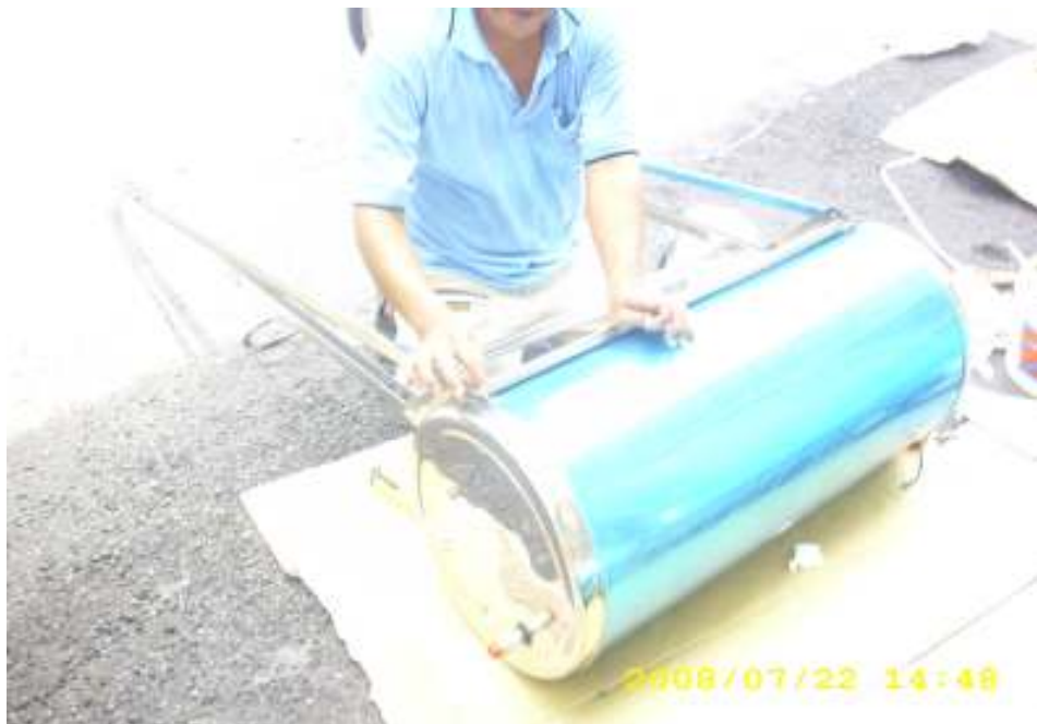
Figure 2.0 : Installation of the solar heater system parts in progress