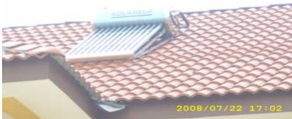
Figure 3.0 : The household in Seberang Perai Selatan, Pulau Pinang which implemented the solar heater system