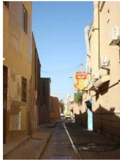
Figure17: the lack of direct view to

Sidewalks: Sidewalks are the location for the presence of all the citizens and their cooperation in their public life. Although flexibility is one of the important features of sidewalks, but what guarantees the presence of citizens therein is the security of such spaces.