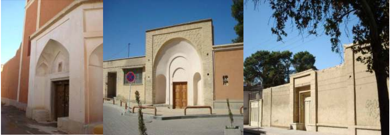
Figure15: The presence of stages for sitting beside the houses entrance

Enclosure: In the alleys and impasses, the strangers are not well accepted since their entrances are built in a way that defines their own territory and reminds the passersby of more public passageways that they are encountering a more private space wherein they can not freely move about or have recreation. This characteristic is usually implied through narrowness, the lack of direct view to the alleys and/or the presence of ceiling or awning.