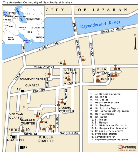
Figure2: map s of Jolfa

The early development of Jolfa dates back to 400 years ago during the reign of Shah Abbas I, when Shah Abbas Safavi transplanted the Armenian people to Isfahan in order to protect hem against violation and attacks on the part of the Ottoman Empire. In 1603 AD, Shah Abbas arrived in Tabriz, then proceeded to Nakhjivan and conquered Jolfa and then Irvan; and passed all the Armenian across the Aras River into Iran where he settled them then. The Great Shah Abbas' period especially during Shah Abbas II's reign was the heyday of this territory, and this situation sustained into some periods afterward.