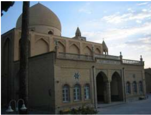
Figure 6: view of Vank Cathedral

The historical Jolfa at the Safavis era had been located on the barren lands, fertile plains, and gardens in the south of Zayandehrood and its design had been based on that of Bagh-Shahr and Bagh-Rah. Nazar Street was the backbone of Jolfa; Shahmarimanian and Sarfarazian gates were surrounding the Big Square and the Small Square and up to Ghajars' reign over Jolfa were devoid of any rampart or wall. On two side of Nazar Street were the Big and the Small squares, the construction history of which with regard to the strength of the buildings around it dates back to the beginning of Pahlavi era. However, there is no doubt that the place had earlier been used as an open space or a meeting house with social functions at the seasonal square of Jolfa, and because of the connection between the neighborhoods at the river banks and Nazar Street, the north-south crossing known as Dahgane had been extended from the river side to this street.