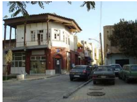
Figure11: Chaharsoo square