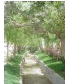
Figure 14: Natural elements abound in alley

In this section, four factors influencing the spatial quality of Jolfa, i.e., tranquility, the sense of belonging, enclosure, and public sidewalks, are investigated. Tranquillity: Natural elements abound in all the alleys and impasses and due to the hierarchy of supervision provided by citizens, these set the ground for mental tranquility. Balance in bodies and avoiding the employment of a variety that attracts attention controls emotions in the structural space and while keeps you away from monotony, does not disturb your peace. At the same time, the exposure of the alleys to more public space is inhibited through forming windings.