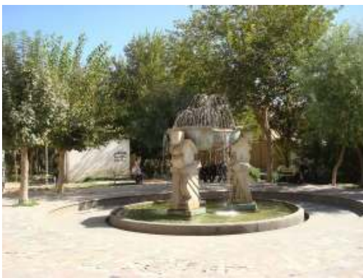
Figure 7: Sangtarashha neighborhood square