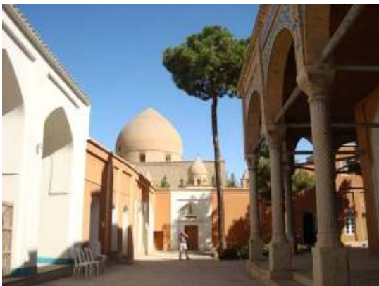
Figure10: interior court view of St. George Church