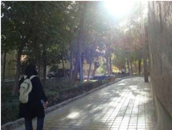
Figure 18: one of the Sidewalks in the jolfa district