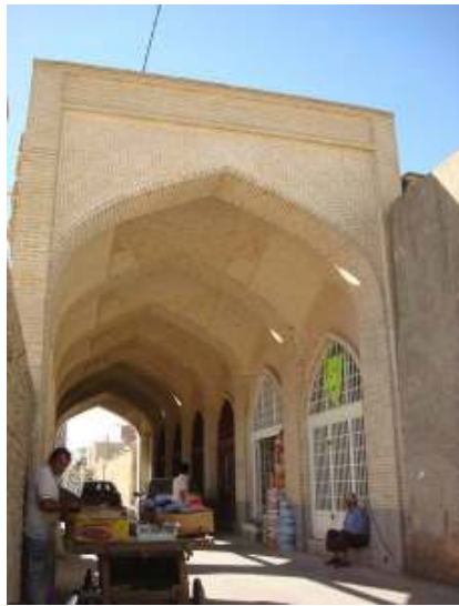
Figure16: sabat the alley

Enclosure: In the alleys and impasses, the strangers are not well accepted since their entrances are built in a way that defines their own territory and reminds the passersby of more public passageways that they are encountering a more private space wherein they can not freely move about or have recreation. This characteristic is usually implied through narrowness, the lack of direct view to the alleys and/or the presence of ceiling or awning.