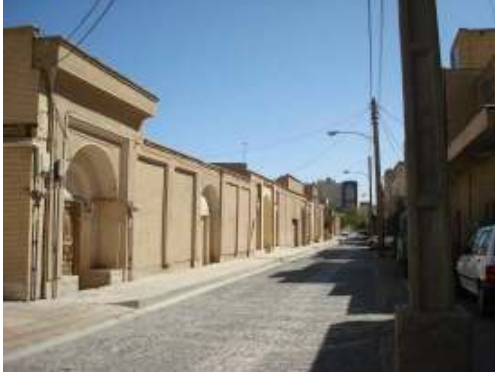
Figure 13: view of The Big Square

taste of variety in the space and increases the enclosure sense of the environment. The entrance of each house slightly pulls back, and a bench-like resting space has been contrived beside it to provide the pre-space required for entering the house.