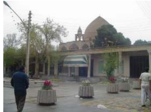
Figure 12: Sangtarashha historical passageway