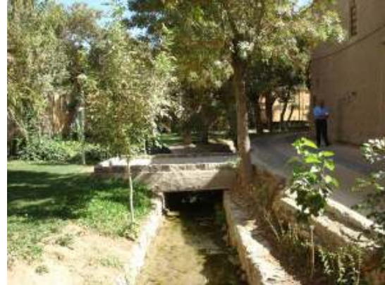
Figure9: part of Shayj madi strip