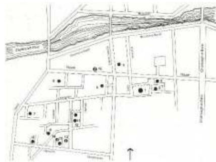
Figure5: maps of new urban district of Jolfa