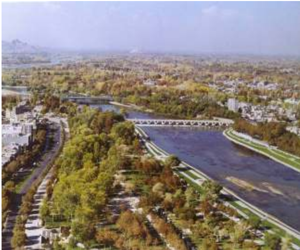
Figure 1: view of isfahan

Under what influences the spatial-physical structure of Jolfa has been constructed? Is the environmental quality and visual outlook of Jolfa open to investigation?