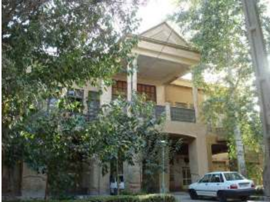
Figure8: one of the historical house remaining

With the exception of some major cases, all the other passageways are either by definitions without commercial land-uses, or just have small shops found all along the western and eastern Nazar, Khaghani, Tohid, Hakim Nezami streets, and main passageways of the town. A series of minor passageways provide the internal connections of Jolfa anyway. However, the provision of internal connections, while some of the minor passageways are considered the main traffic axes of the town, is in many ways thorny.