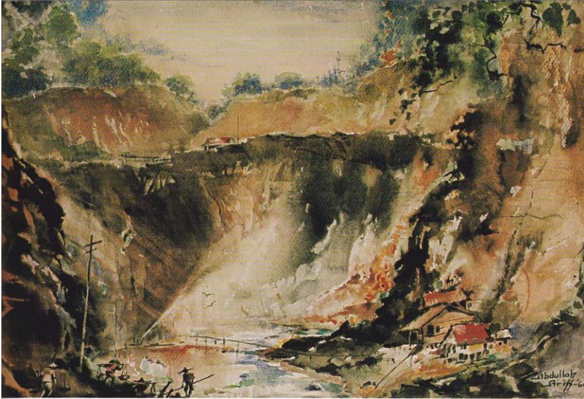
Figure 12: Abdullah Ariff, “Bumi Yang Bahagia Lombong Bijih Timah Malaya” (1960), watercolour on paper, 60.0cm x 75.5 cm

The tin industry was the major pillar of the Malaysian economy during the late colonial to early independence period. The scene of tin mine is captured with warm colour scheme with the schematic of the foreground, middle ground and background created a recessive form of depth and space. With the angle perspective that the artist applied in this painting, it gives a wide and magnificent feel to the viewer that could also be seen as an artistic documentation of the economic activities of the country and yet the precision of Abdullah Ariff’s rendition came to the extent that the image of the three workers was drawn at the bottom left of the painting.