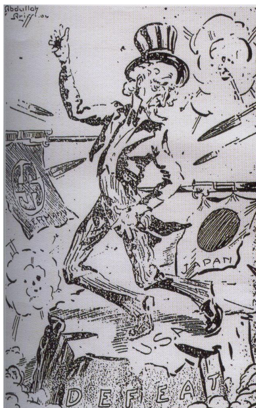
Figure 9: “No Way to Escape”, Penang Daily News , 9 October 1942

On top of that, the various caricatures that he did for Penang Daily News also reflected his worldly knowledge of international politics. For example, in “Anglo Saxon Imperialism” (Figure 8), characters such as Uncle Sam and Winston Churchill are seated on a carriage, carried by local figures, the man wearing the songkok , and the man wearing sarong and turban were carrying the carriage reflecting the imperialist ideas. Thus, as these works were for the Penang Daily News , the anti-Western stances are overt as could be seen in “No Way to Escape” (Figure 9). The Americans through the image of Abraham Lincoln as Uncle Sam, that is about to be stabbed by German and Japan bayonets. Perhaps similarly, Abdullah Ariff seems to reiterate Appiah’s observation that “..., the cosmopolitan patriot can entertain the possibility of a world in which everyone is a rooted cosmopolitan, with its cultural peculiarities, but taking pleasure of the presence of others, different places that are home to others, different places that are home to other different people” (Appiah 1997, p. 618) that he produced these images in local newspapers.