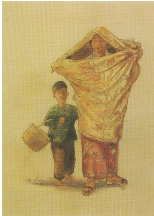
Figure 10: Abdullah Ariff, "Mother and Child" (c. the 1930s), watercolour, 28 x 20.7 cm

Despite Abdullah Ariff's worldly renditions, his watercolours were more intimate in capturing the local scenes. The usage of watercolour was quite common by the early 20 th century artist in Malaya as it is a very good and fast medium in capturing the changing landscape and surrounding views. The fact that he mastered such technical aspects of watercolour had allowed him to be a part of the Penang Impressionist in the first place as highlighted in the earlier part of this paper. Unlike his illustrations and caricatures, Abdullah Ariff was still bonded with his impressions of local people (Figures 10 and 11) and landscapes (Figure 12) that could be seen in most of his watercolour works.