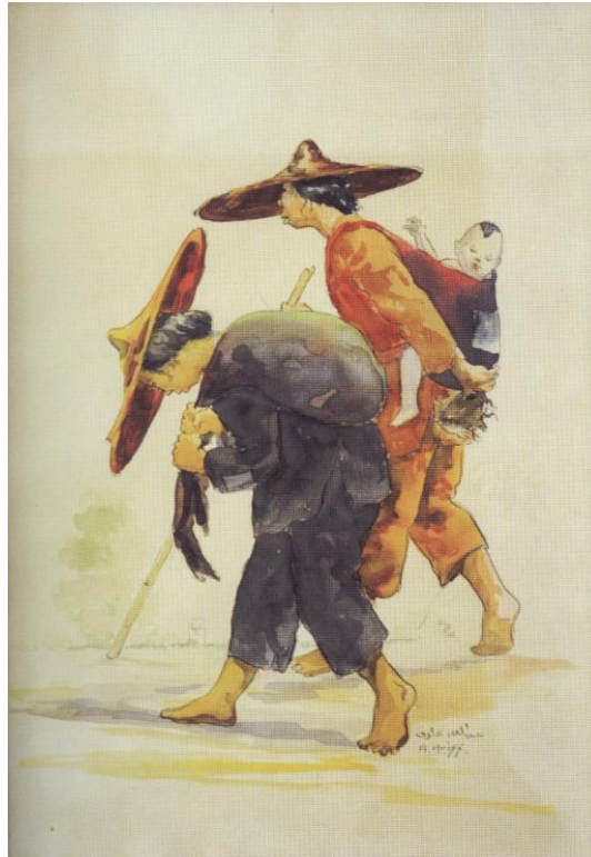
Figure 11: Abdullah Ariff, “Two Chinese Women” (c. the 1930s), watercolour, 28 x 20.7 cm