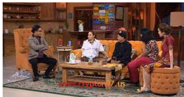
Picture 2 The Setting of The Talk Show