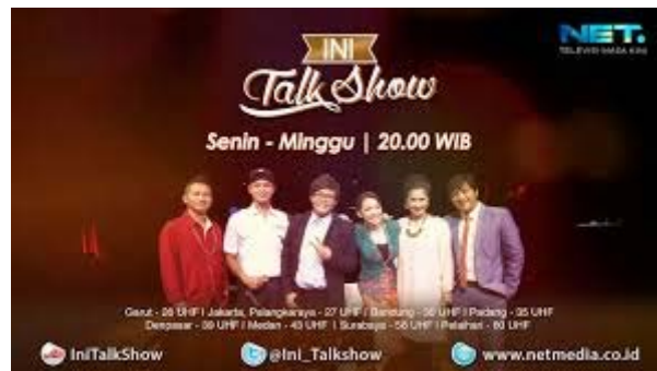
Picture 1 The characters in Ini Talk Show

In this level, reality can be seen in appearance, dress, make-up, environment, behavior, speech, gesture, expression, sound, etc.