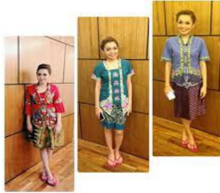
Picture 3 The appearance of Maya

Maya, the character of the domestic help, wears Kebaya and knee-length Kain and she always wears sandals in every episodes. With this appearance, the audience will find out that the dress represents social status.