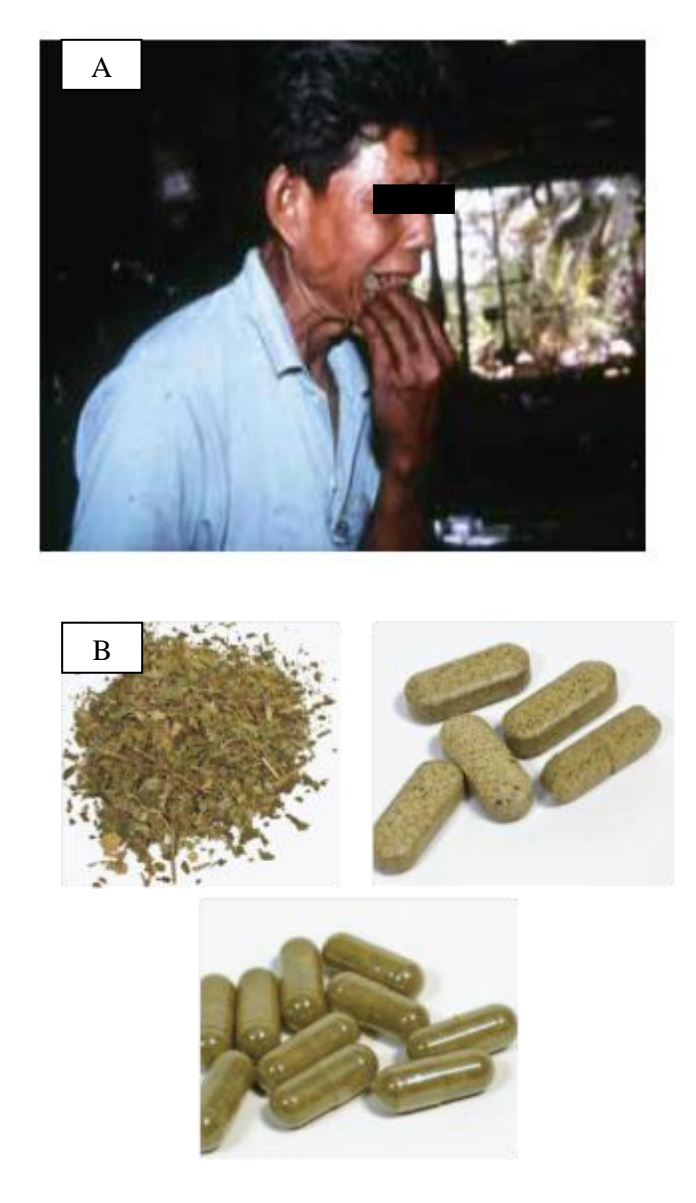
Figure 2.2: (A) A kratom user chewing the kratom leaves. Picture is adapted from Matsumoto, (2006) (B) Products of kratom sold in the market. Pictures are adopted from Prozialeck et al. (2012).