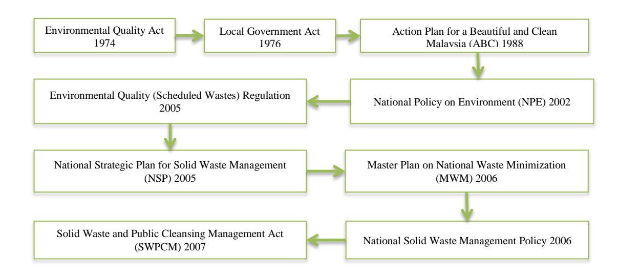
Figure 1.3: Evolution of solid waste related regulation in Malaysia

Environmental Health and Project Implementation Division, Department of Local Government (JKT), Ministry of Housing and Local Government. This function was later transferred to JPSPN and PPSPPA. Figure 1.3 below describes in brief the evolution of solid waste related regulation in Malaysia. SWPCMA was coined based on best solid waste management practices of developed countries such as Denmark, Japan and Germany. It particularly focused on managing sanitation & public cleanliness. It must be duly noted here that Penang and Selangor have decided to opt out of this centralised solid waste management scheme when it was enforced in the year 2011 which means the respective states and local authorities manages its solid waste (Abas & Wee, 2014).