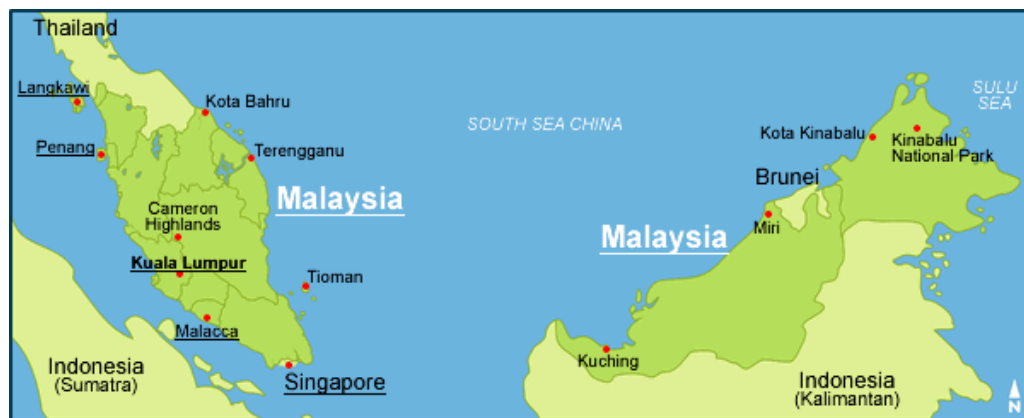
Figure 1.1: Location of Malaysia in Southeast Asia

Being located in Southeast Asia (Figure 1.1), Malaysia consists of two distinct territories: West Malaysia (Peninsular Malaysia) and East Malaysia. Peninsular Malaysia is located in south of Thailand, north of Singapore and east of Indonesian island of Sumatra. East Malaysia lies on the island of Borneo and shares borders with Brunei and Indonesia.