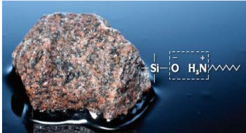
Plate 2.2: Interaction of Rediset with a Siliceous Aggregate (AkzoNobel, 2013)