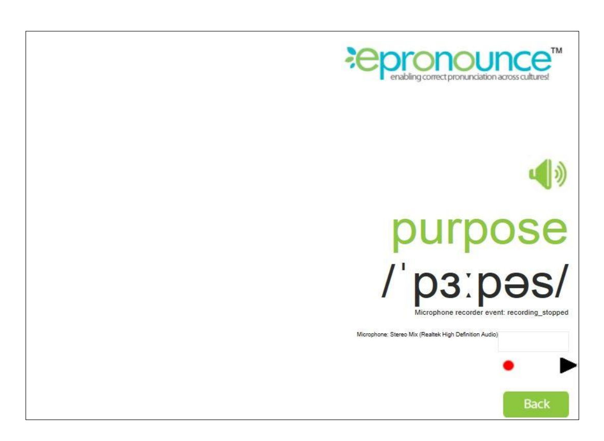
Figure 1.4 Text + Sound + Phonetic Symbols (TSP)