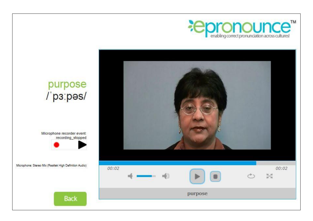
Figure 1.6 Text + Sound + Phonetic Symbols + Face Gestures (TSPF)