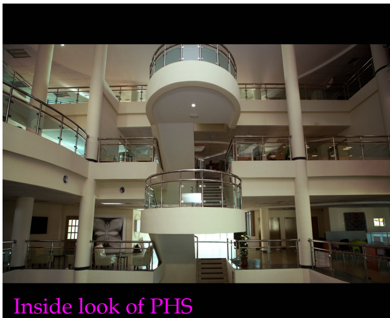
Inside look of PHS