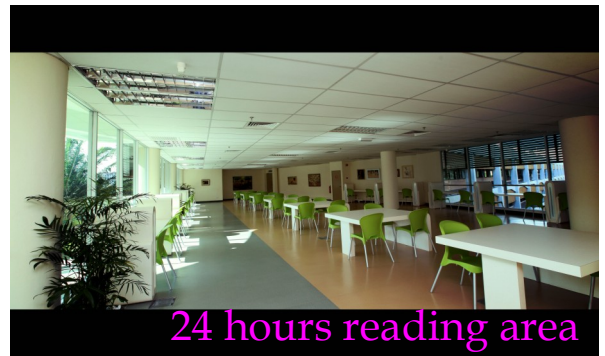
24 hours reading area