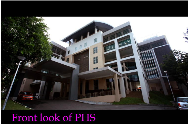
Front look of PHS