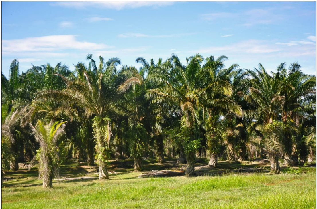
Figure 2.1: oil palm trees located at oil palm plantation

Oil palm tree, belongs to the species name of Elaeis guineensis , it is one of common species of palm tree (as shown in Figure 2.1). The mature oil palm tree averagely can grow up to 20 meters, with pinnate shape leaves, and bunches of reddish palm fruit (Sumathi et al., 2008). Currently, the core purpose of oil palm planting is for the extraction of palm oil from the fruits (Yusoff, 2006). Palm oil is the largest production in the oils and fats sources compared with the other major sources such as soy oil, rapeseed oil, sunflower seed oil and etc (Anonymous, 2013). Other than palm oil extraction from oil palm fruits, the other biomass components of oil palm tree are still underutilized.