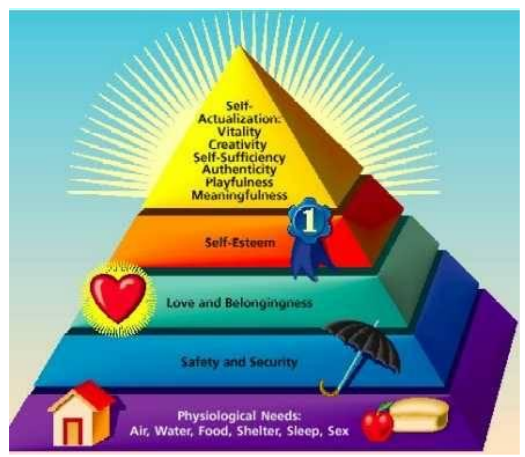
Figure 1.1, Maslow's hierarchy of needs (D'arby, 2009)

way to look at how people live, how they order their priorities and set their goals in life. Maslow suggested that life consists of five levels which range from elementary where we satisfy the most basic needs, like food and shelter to where we satisfy our highest psychological needs, like those for inner emotional fulfilment. Maslow Theory of Needs suggested that higher needs can only be fulfilled once the lower needs are met (Pooler, 2003). According to Pooler (2003), he also argued that when it comes to shopping, our lower level needs have being met and that we're shopping on a higher plane, where a higher level of needs is being satisfied. To aid the decision making, a brand name provides a shorthand device or means of simplifications for their product decisions (Keller, Aperia & Georgeson, 2008).